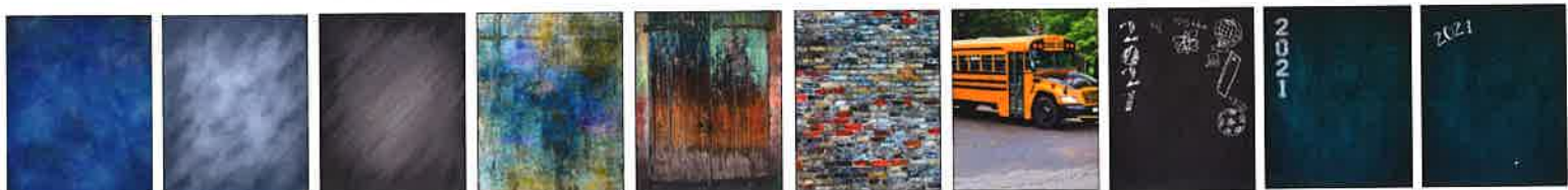
*Choice #TR2 Choice #TR3 Choice #TR114 Choice #MO7 Choice #MO27 Choice #MO215 Choice #EN57 Choice #BC9 Choice #BH3 Choice #BH10

Wallet Size: Jumbo Wallets = 2 1/2" x 3 1/2" - Exchange Wallets = 1 3/4" x 2 1/2"