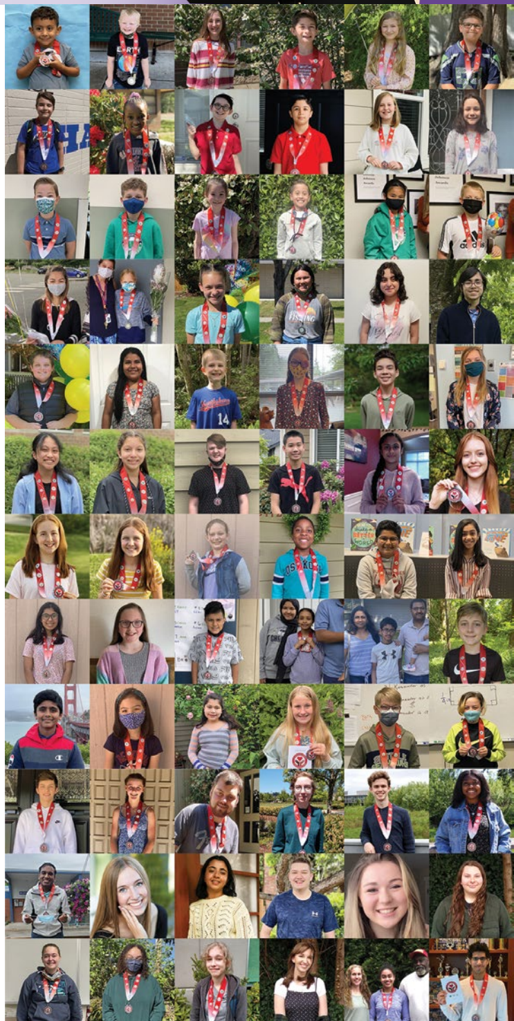
Student recipients of the C.P. and Dorothy Johnson Humanitarian Award

To learn more about the award program and to watch the virtual ceremony at any time visit nsd.org/humanitarian .