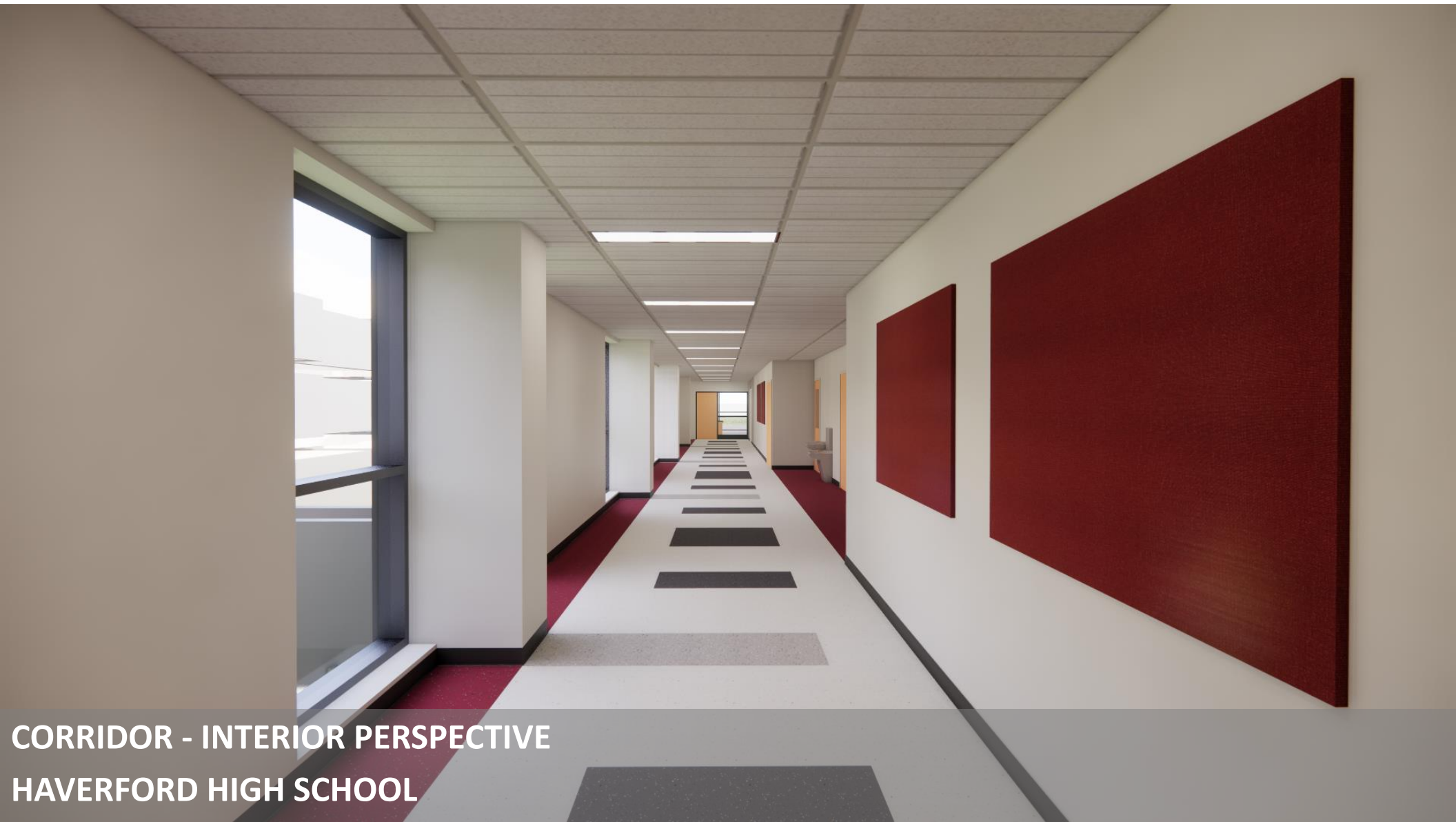
CORRIDOR - INTERIOR PERSPECTIVE HAVERFORD HIGH SCHOOL