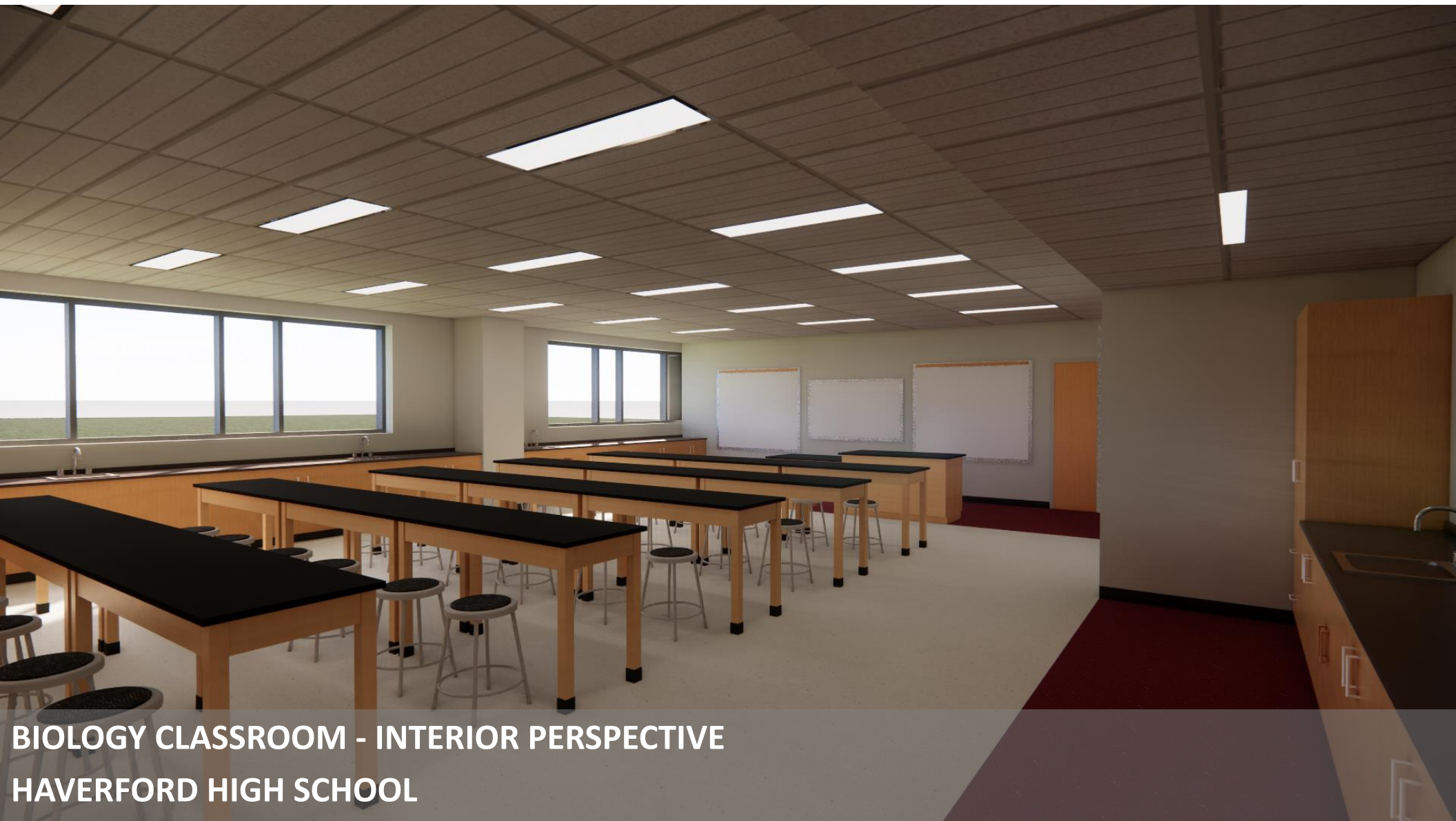
BIOLOGY CLASSROOM - INTERIOR PERSPECTIVE HAVERFORD HIGH SCHOOL