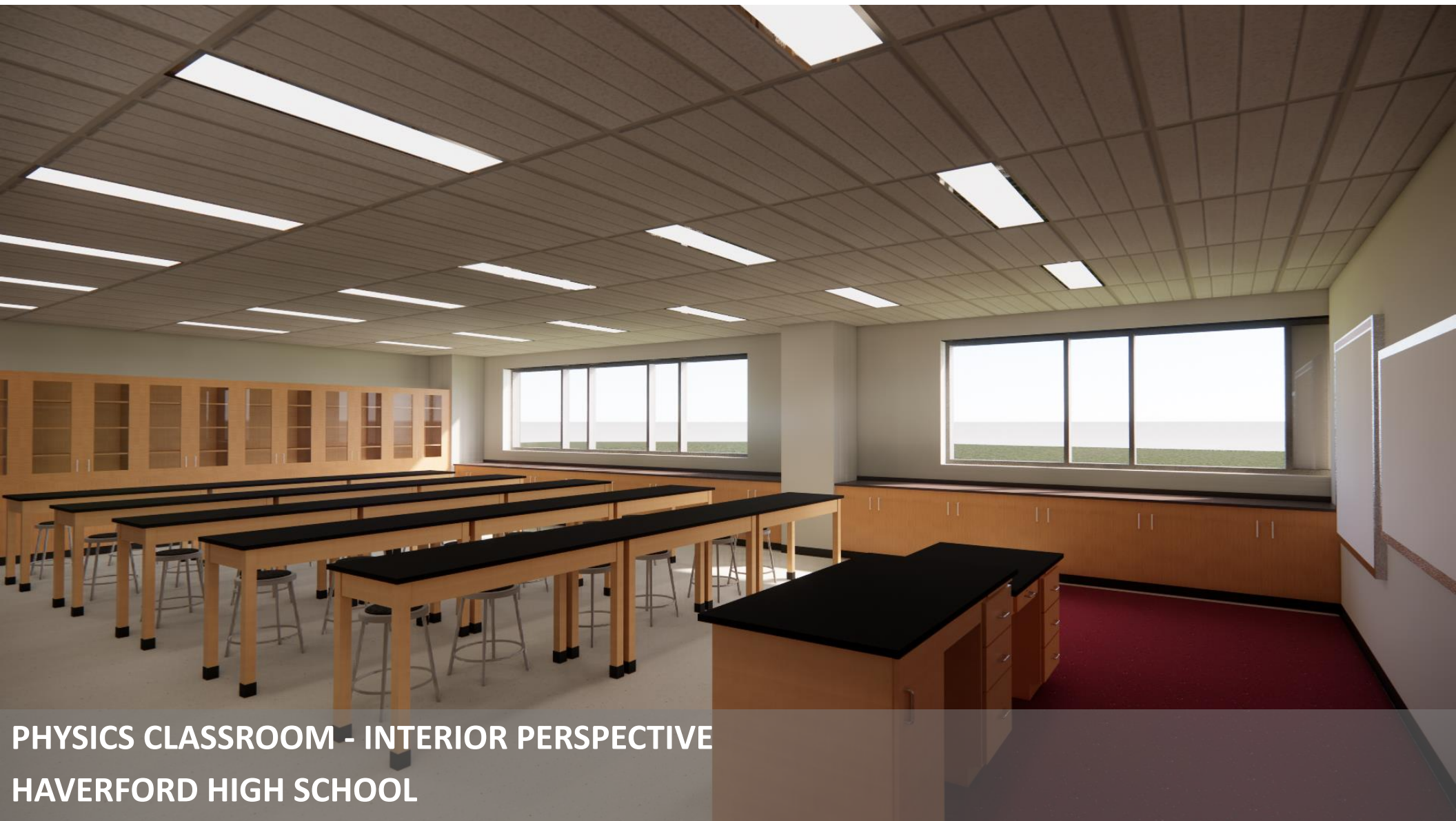
PHYSICS CLASSROOM - INTERIOR PERSPECTIVE HAVERFORD HIGH SCHOOL