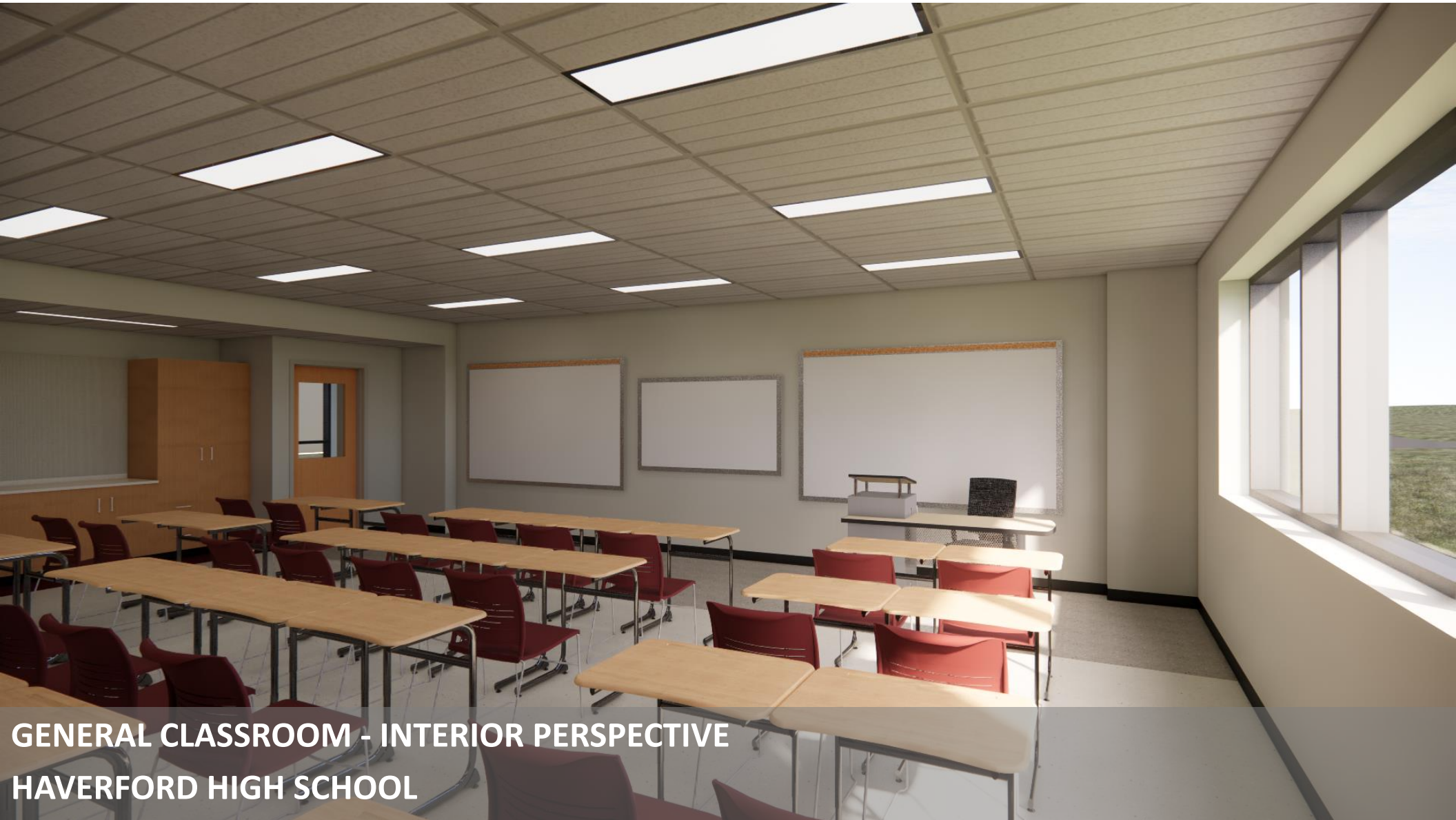
GENERAL CLASSROOM - INTERIOR PERSPECTIVE HAVERFORD HIGH SCHOOL