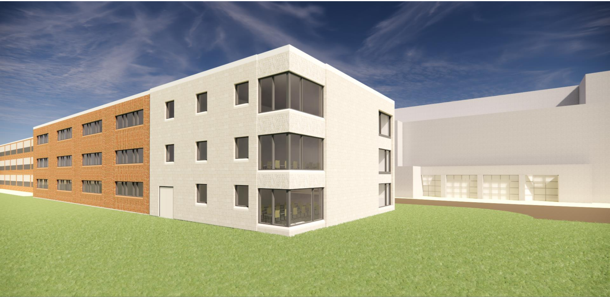
3-STORY CLASSROOM WING - EXTERIOR PERSPECTIVE HAVERFORD HIGH SCHOOL