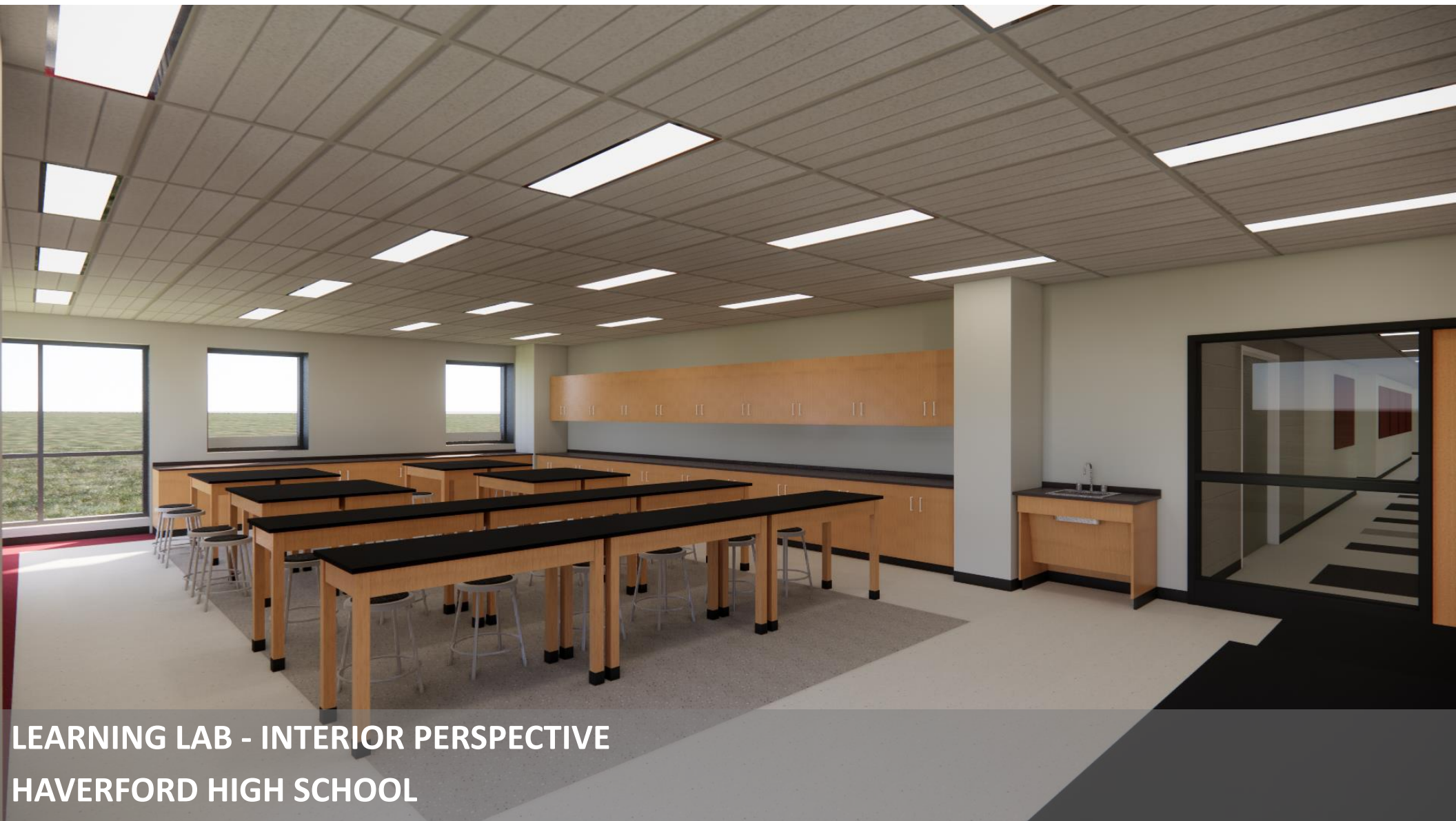
LEARNING LAB - INTERIOR PERSPECTIVE HAVERFORD HIGH SCHOOL