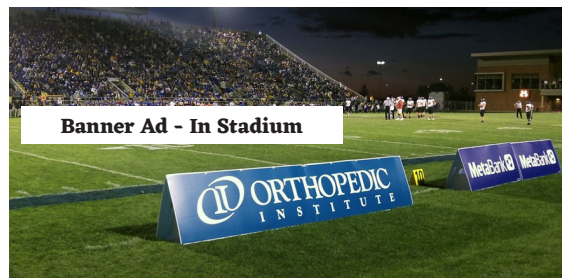
Banner Ad - In Stadium