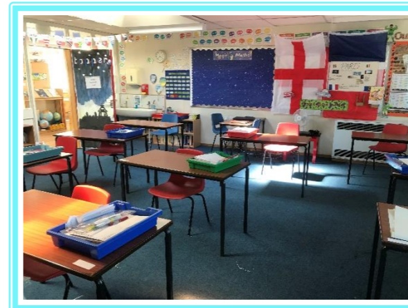
Your new classroom.

I am looking forward to kicking the year off!