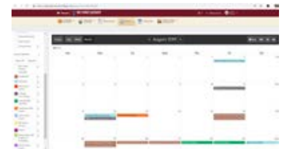
OnCampus calendar monthly view showing school calendar. These events feed our public website calendar.

See reverse side for step-by-step instructions on how to subscribe to your student's class schedule.