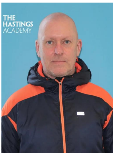
P Senior Assistant Principal