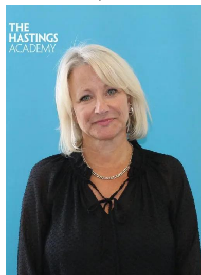
A Stanley Academy Business Manager