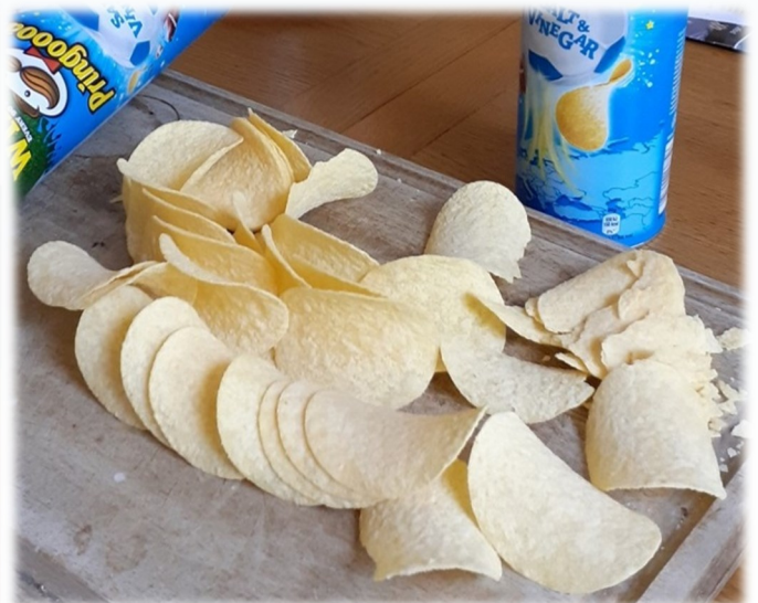
Sadly, Miss Gravely's Pringle Ringle attempts were somewhat less successful - but she still enjoyed eating the Pringles!