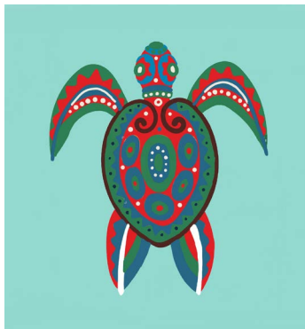
2nd – Chloe B Year 6