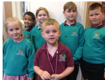
Middle Academy Council Members