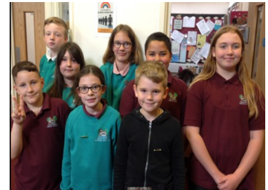
Upper Academy Council Members