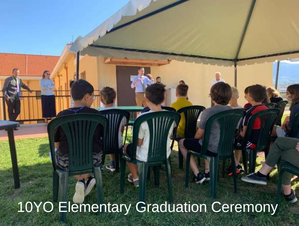
10YO Elementary Graduation Ceremony