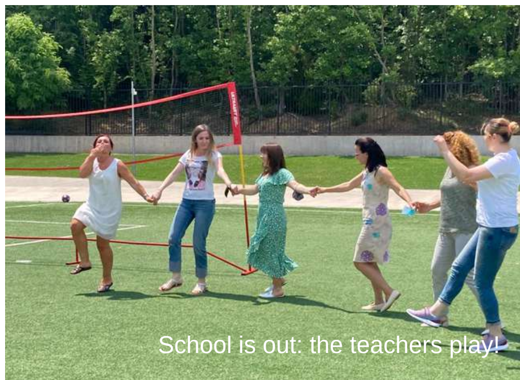
School is out: the teachers play!