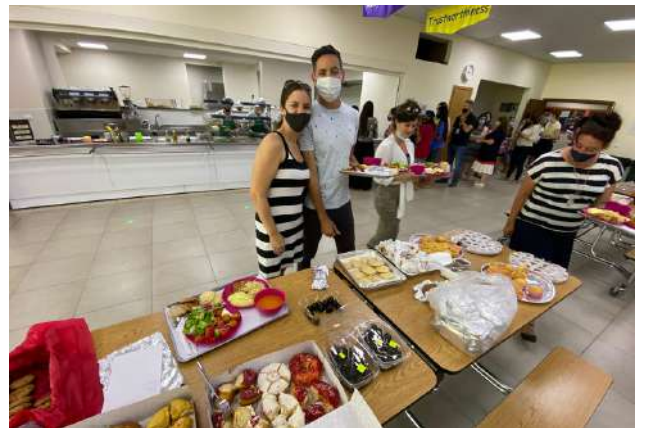
Pictured above: Thank you PSG parents and others who prepared a delicious dessert buffet for the staff!