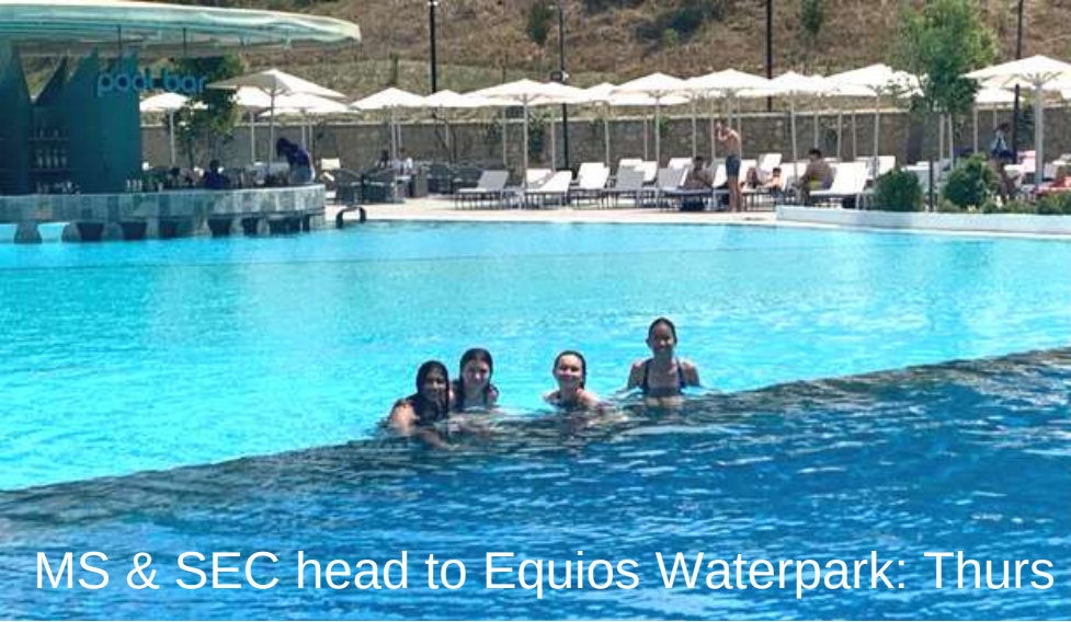
MS & SEC head to Equios Waterpark: Thurs