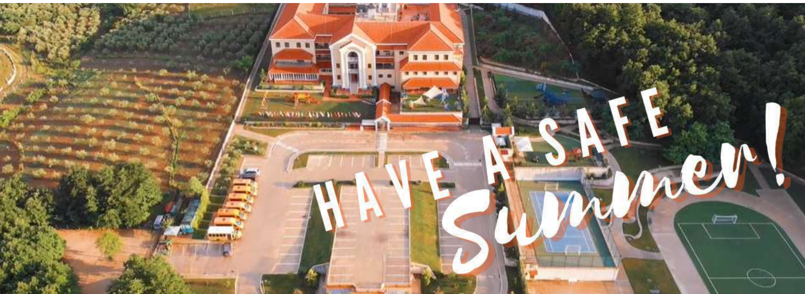
Pictured above: The TIS campus as the sun goes down on the 20-21 school year.