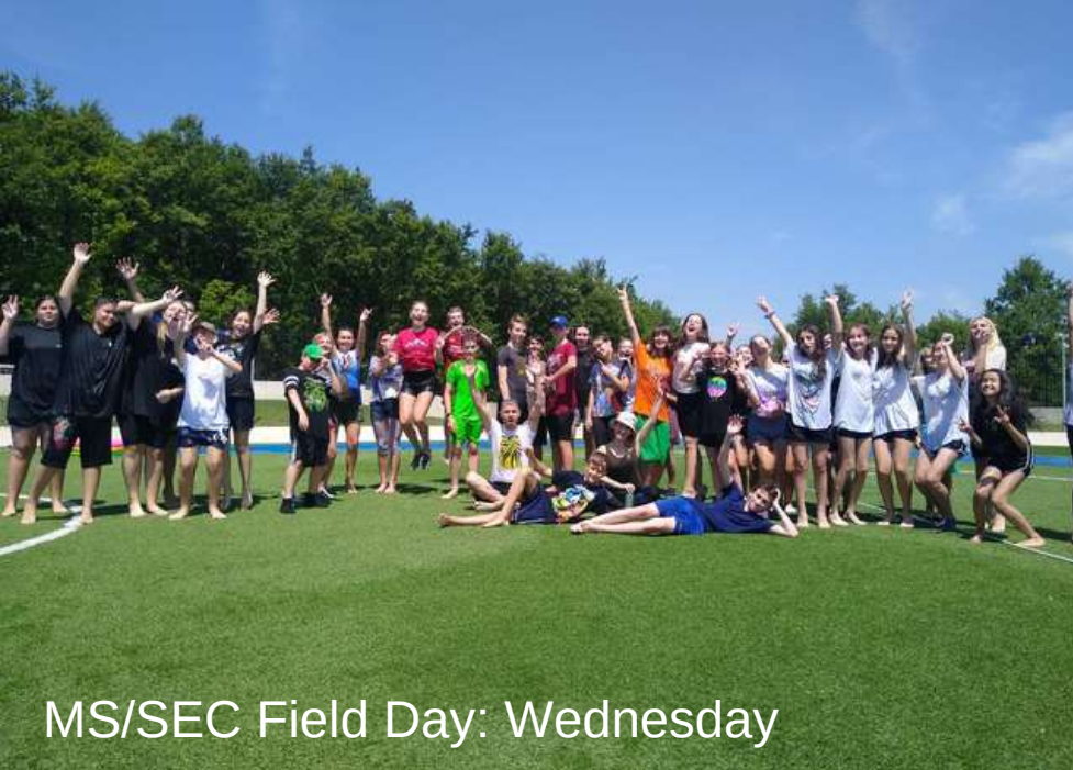
MS/SEC Field Day: Wednesday