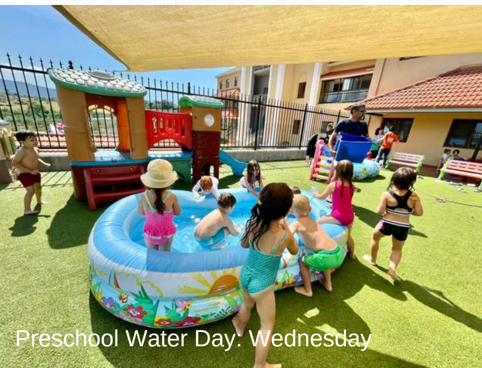
Preschool Water Day: Wednesday