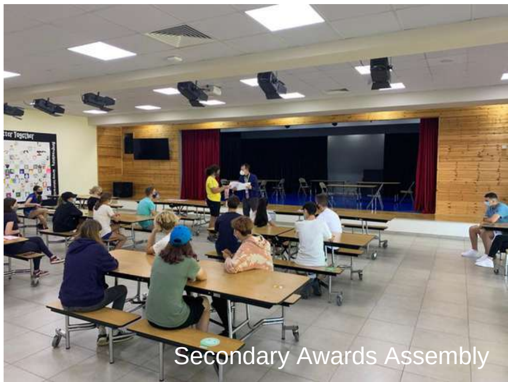
Secondary Awards Assembly