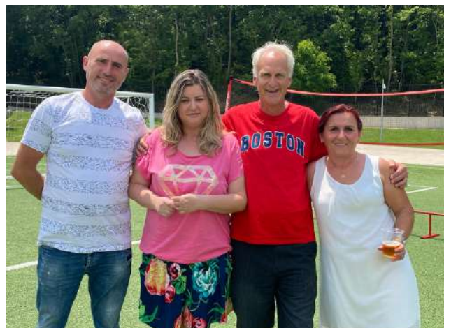
Pictured below: We celebrate and honor the staff members that have worked for TIS/QSI for 25+ years!