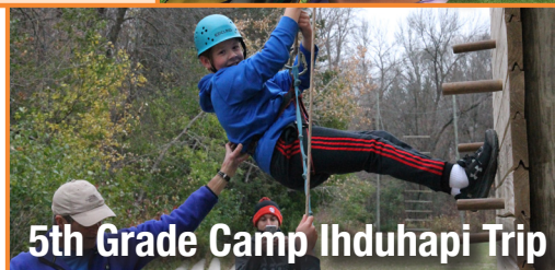
5th Grade Camp Ihduhapi Trip

Kids Place location for before and after school child care