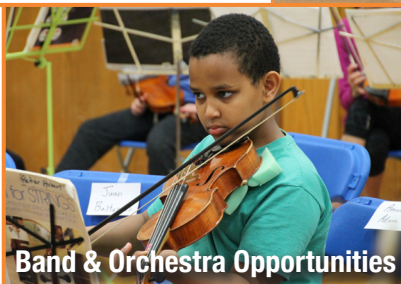
Band & Orchestra Opportunities

White: 50.2% Black/African American: 23.3% Two or More Races: 11.2% Hispanic/Latino: 10.8% Asian: 3.0% American Indian/Alaska Native: 1.3% Native Hawaiian/Pacific Islander: 0.2%