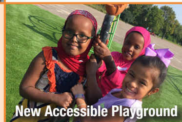
New Accessible Playground