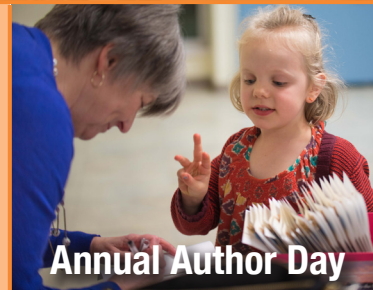
Annual Author Day

Social, emotional, and mental health services available to all students