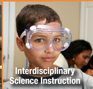
Interdisciplinary Science Instruction

Social, emotional, and mental health services available to all students