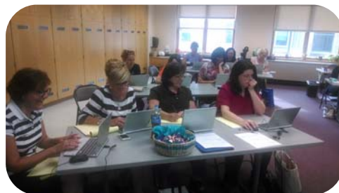
Staff Members Use Chromebooks to Learn Google Apps for Educators