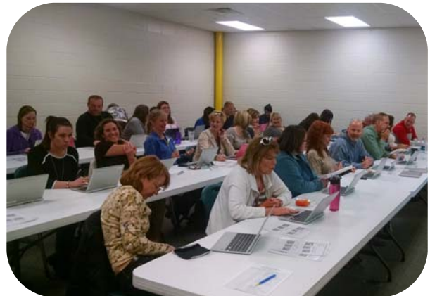
Staff attend one of their self-selected Professional Development sessions