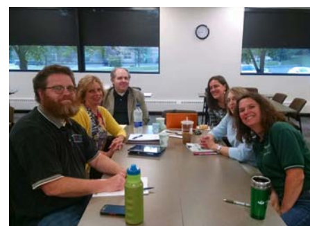
HS Staff Members attend Believe in Ohio Professional Development Training

The project "Facilitating Students' Transition from Secondary to University Writing" takes a dual approach and involves the following two key areas: