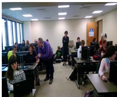
Baldwin Wallace students receive advice and technology instructions on how to tutor high school students in the writing process.

The project "Facilitating Students' Transition from Secondary to University Writing" takes a dual approach and involves the following two key areas: