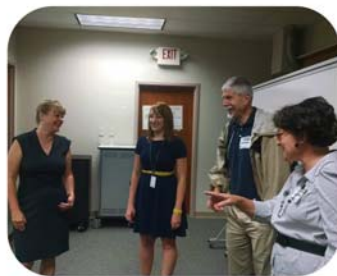
HS Staff Members Welcome BW Professors

We are pleased to be working in conjunction with the Cuyahoga County Educational Service Center (ESC) and other colleges and high schools to help our high school students transition to college writing.