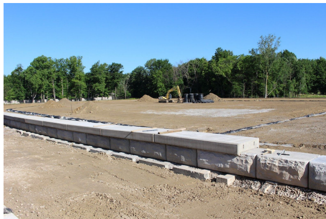
Strongsville Middle School Playing Surface Construction Photo Taken on 06.24.16