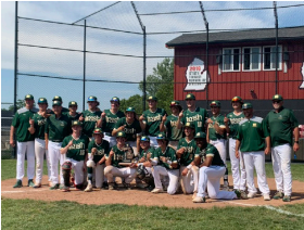
The Notre Dame Varsity Baseball team earned a 1-0, walk-off win over Goodrich to secure an MHSAA District Championship