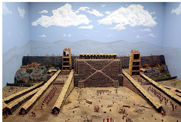
Figure 8: Model of the siege of Avaricum

60. Why was it so difficult for the Romans to overtake the Gallic walls at Avaricum? How did they eventually overtake the walls?