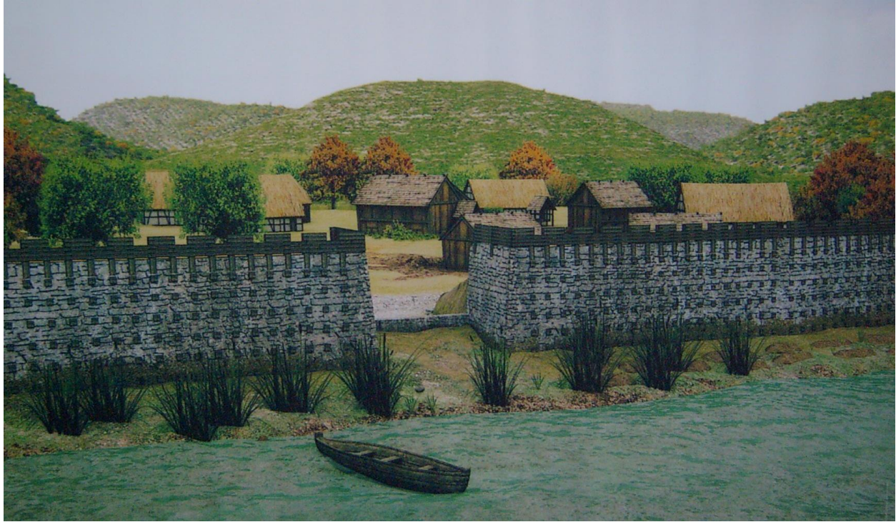
Figure 6: This is a oppidum surrounded by high walls. The houses are made of wood and mud.

18. What fear did the Romans have of the Germans and what impact did it have on the army?