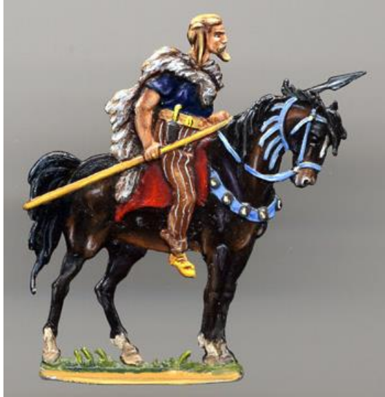
Figure 4: Drawing of Ariovistus by Fritz Krischen, engraving Ludwig Frank, edition Hahneman (Ochel).

14. What threat does Ariovistus pose and how does Caesar learn about it?