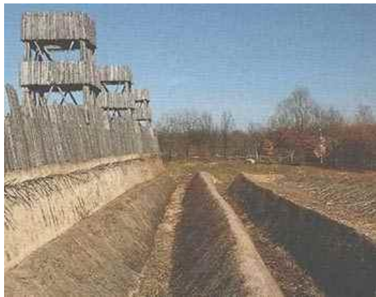
Figure 10: A reconstructed section of the Alesia investment fortifications

78. How did the Gauls fortify Vercingetorix's camp?