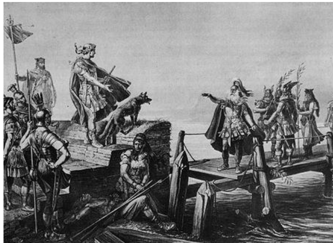
Figure 2: Helvetii chieftain Divico negotiates with Caesar after the battle of Bibracte

7. Who induced Caesar to get involved with the Helvetii. Do you think this invitation was anticipated by Caesar? Why?