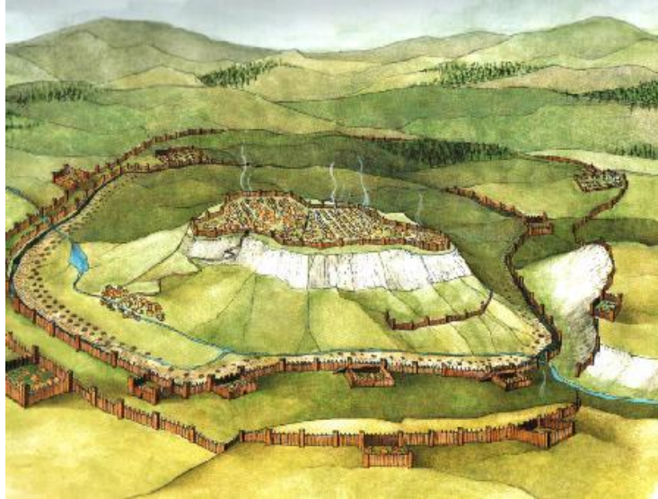
Figure 11: 1899 painting of Caesar's Seige of Alesia by Lionel-Noël Royer

81. Why does Vercingetorix send away his cavalry before the completion of Caesar's fortifications?