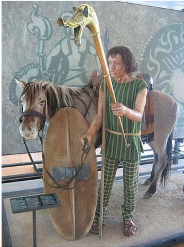
Figure 3: A reproduction of an aide-de-camp of Helvetii cavalry commander Dumnorix at the Musée de la civilisation celtique, Bibracte, France

9. How did Caesar get information about Dumnorix's motivations?