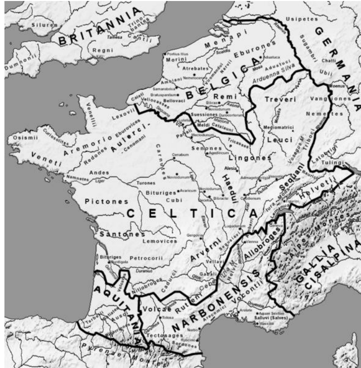
Figure 1: The Roman Provinces in Gaul around 58 BC; note that the coastline shown here is the modern one, different from the ancient coastline in some parts of the English Channel

1. Outline each of the following territories in the colors indicated: Belgae (blue); Celts/ Gauls (yellow), Aquitani (red):