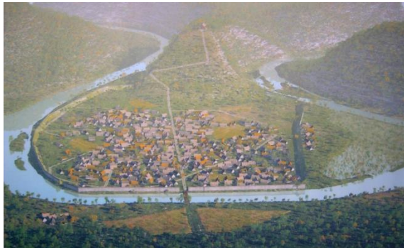
Figure 5: The Sequani build their capital, named Vesontio in the loop of the Doubs, which serves as natural protection.

16. Summarize the main points of Ariovistus' argument in Chapter 36.