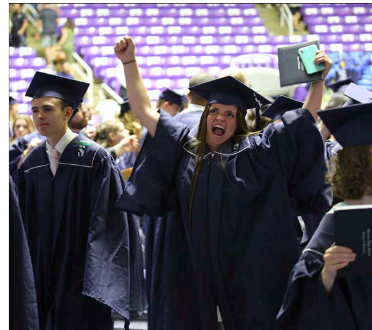
A Syracuse High graduate celebrates as she participates in the recessional.