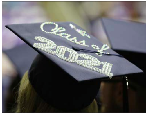
A little bling for the Class of 2021