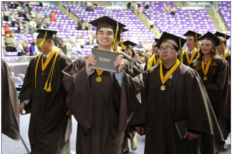
A Davis High student shows off his diploma as students participate in the recessional.

Students plan to attend a variety of higher education institutions including each of the Utah universities. Out-of-state institutions of choice range from Embry Riddle Aeronautical University to Rochester Institute of Technology and Royal Academy of Music.