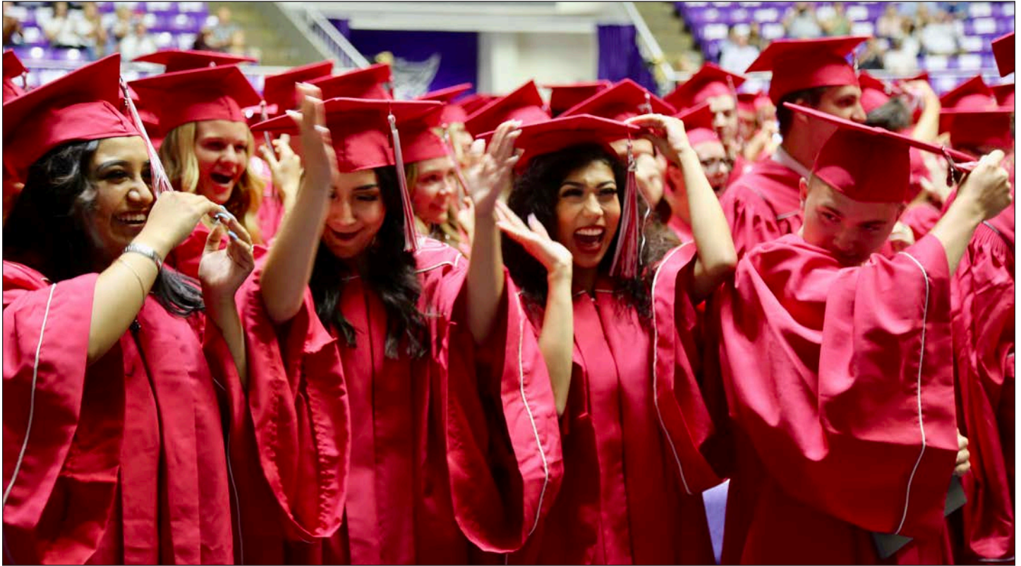
Bountiful High students celebrate after completing the changing of the tassels.