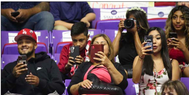
Family members try to capture the moment.