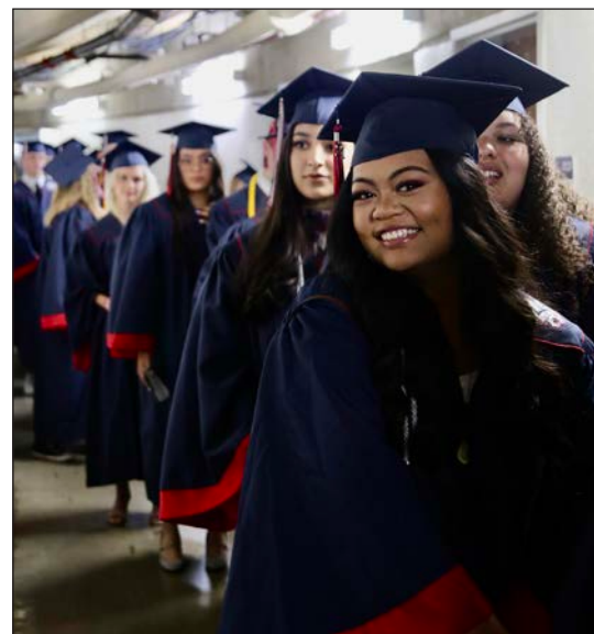
Woods Cross High graduates line the hallway waiting for their name to be announced.