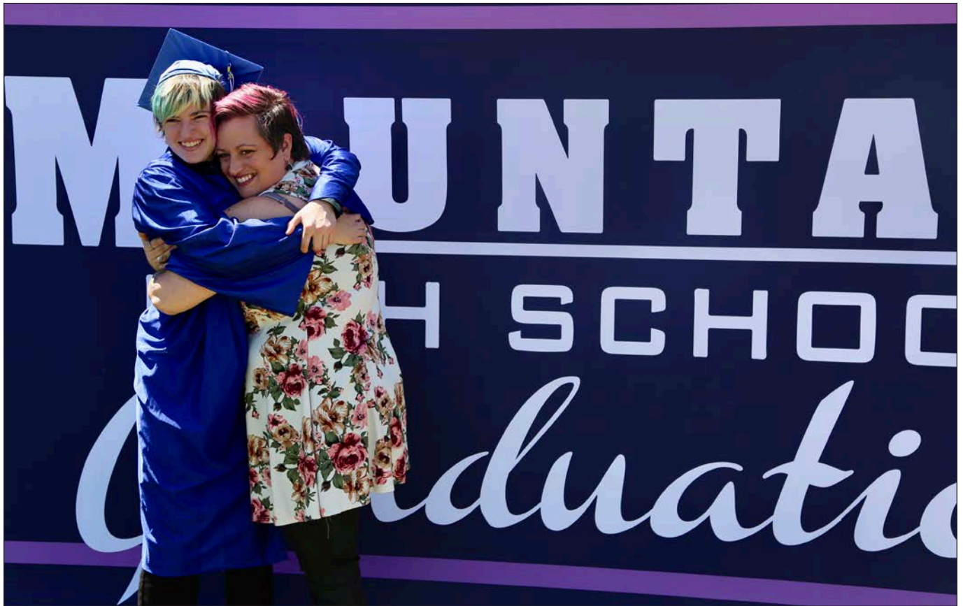
A Mountain High graduate gets a congratulatory hug.