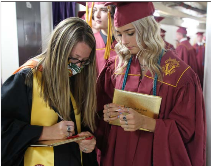
A faculty member signs a note for a Viewmont High graduate.