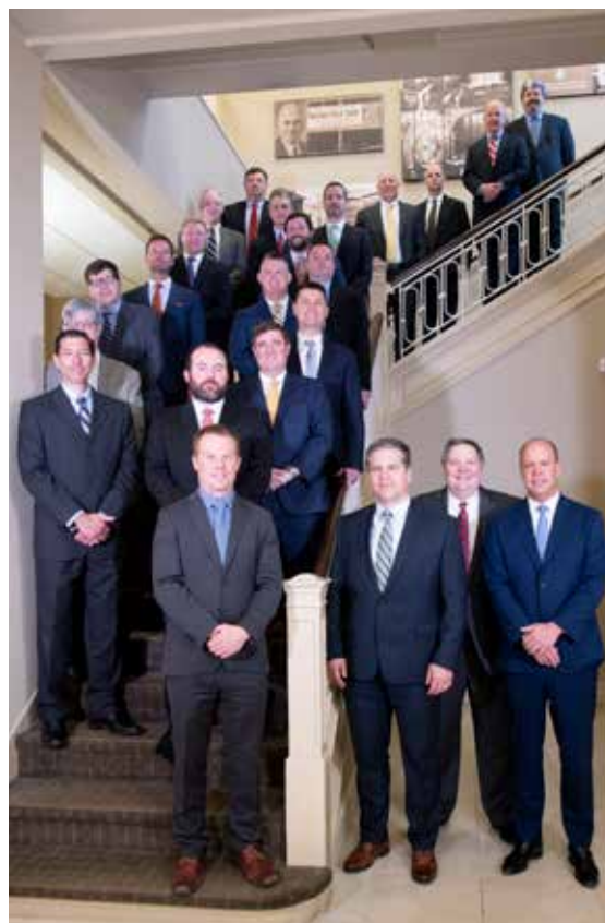
Pictured are many of the 31 St. X graduates employed by Stock Yards Bank & Trust. Five decades of alumni are represented at the company.