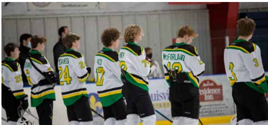
The Tiger Hockey team prepares for its annual showdown against Trinity at Iceland.