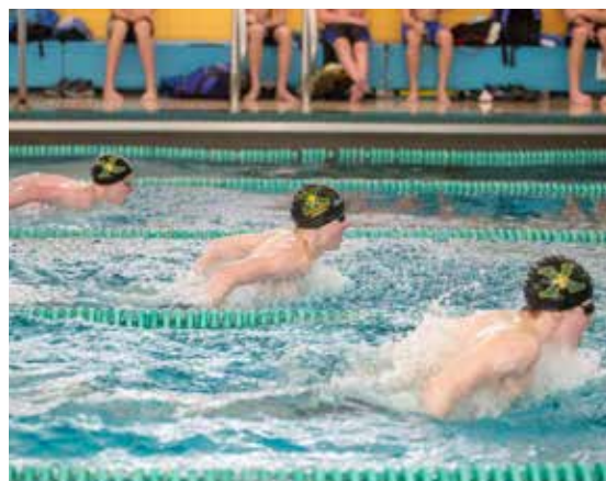
The Swimming & Diving team started the season with a bang by dominating the #1 team in the country, Cincinnati St. X, 198-88. The team would go on to set nine of 12 St. X pool records during the 2021 season.