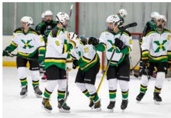
The Hockey team finished the year strong by advancing to the championship game of the JV tournament held in Lexington.