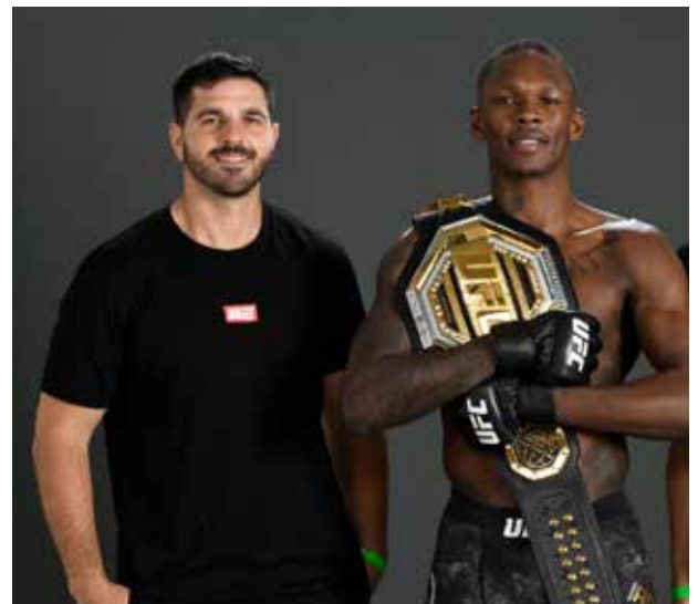
Jeff Sainlar with UFC middleweight champion Israel Adesanya