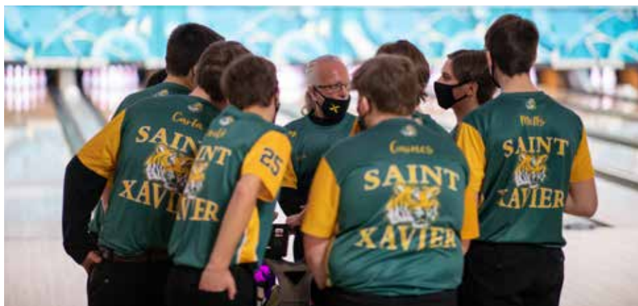
The Bowling team won the Region 4 Team Tournament and had the best finish in program history at the state championship by advancing to the semifinals.