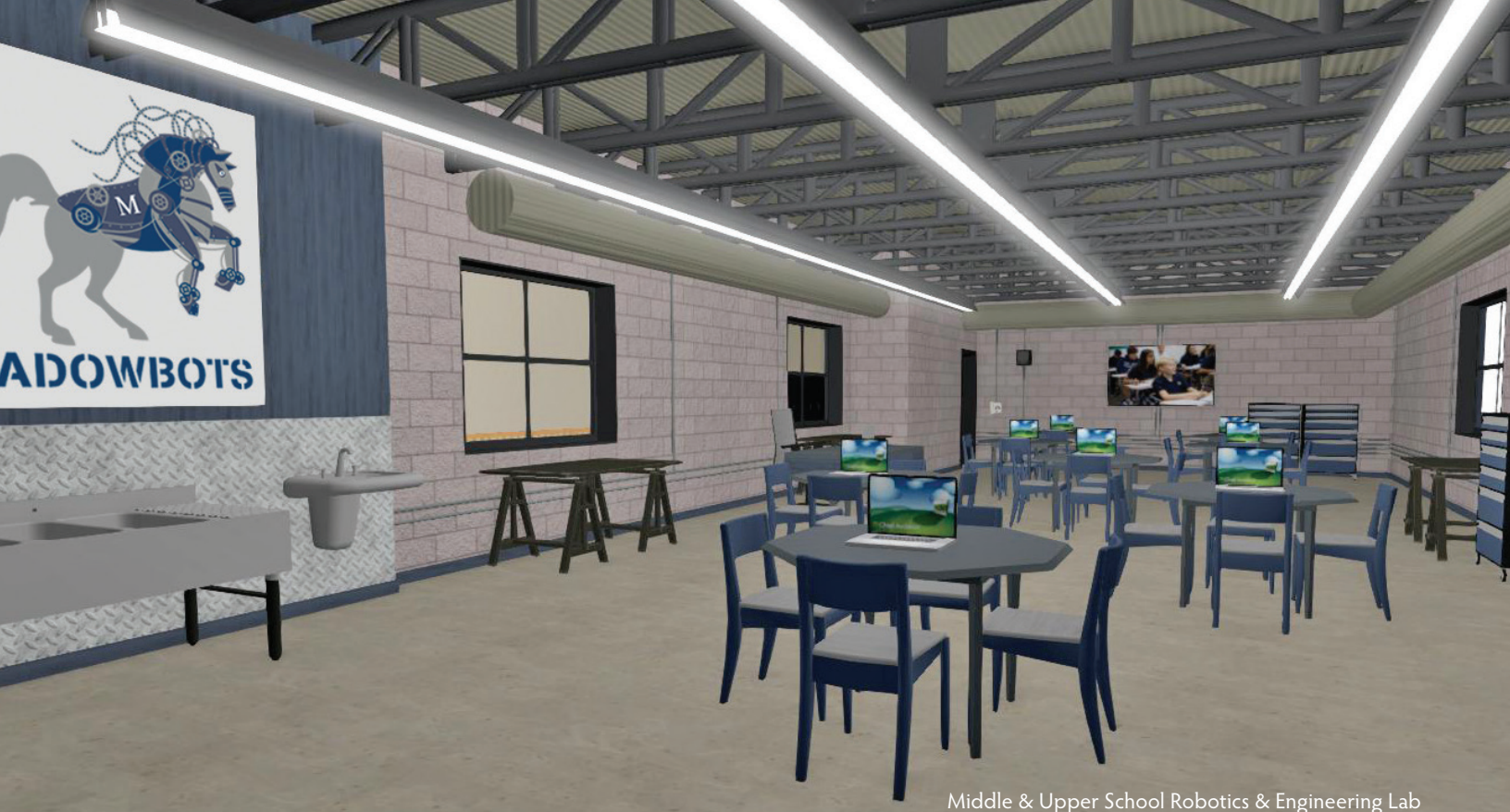
Middle & Upper School Robotics & Engineering Lab