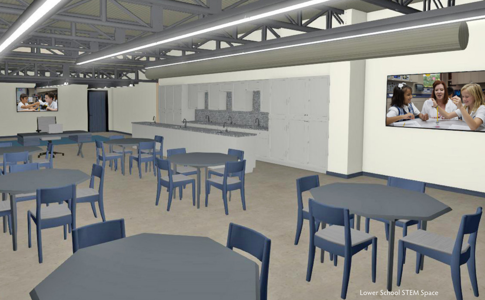
Lower School STEM Space

This ambitious project is the beginning of a multi-year effort to ensure that our students continue to have access to facilities that allow them to explore, discover, and grow in accordance with our mission and core values. Not only will this project add necessary space for an expanding student body—it also sets the stage for exciting developments moving forward. First, the project will provide flexibility in envisioning the future use of the Fertitta-Sturm Middle School building by freeing space currently occupied by Upper School programming. Second, this expansion will showcase the incredible work our faculty and students are doing in the realm of technological innovation. Finally, the space sets the stage for the phased addition of future administrative space and science and arts facilities to replace the current, temporary structures.