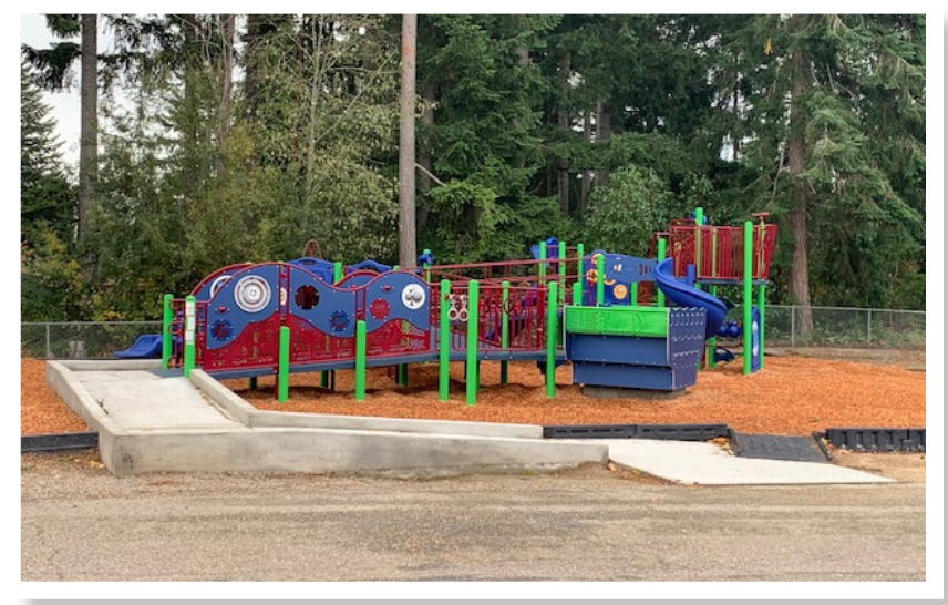
New play structure at Orchard Heights Elementary.

The play structures at Burley Glenwood Elementary, Manchester Elementary, and Olalla Elementary also received updates while school campuses have been closed. The installations are complete and new fall surface material is in place. They are ready to welcome students back on campus. These four campuses were the first phase of the playground refresh planned district wide. Mullenix Ridge Elementary, Hidden Creek Elementary, and South Colby Elementary are next in 2021.