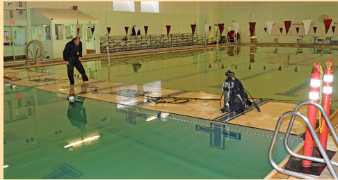
Initial emergency repairs were made to the aging SK Community pool. Long-term renovations will require larger funding options.