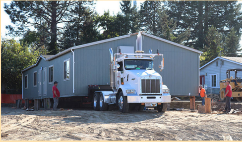
Six new modular classroom were installed at South Kitsap High School.