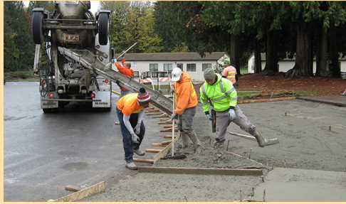
A large section of broken sidewalk was repaired and an ADA compliant ramp installed at Cedar Heights.