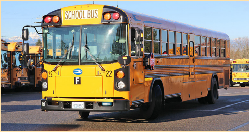
Eight large and four special needs buses were purchased.