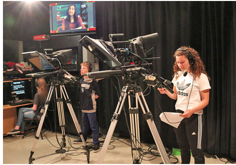
Professional Video Production gives students "real-world" experience in TV productions.