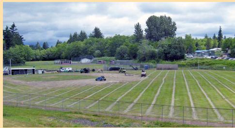
The SKHS boys baseball field was leveled and a new drainage system was installed to help the field stay dry.