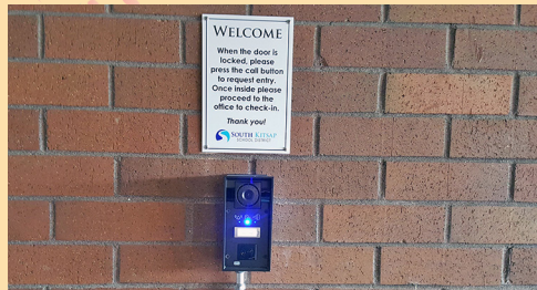
Safety and security at South Kitsap High School was improved with the addition of electronic door locks.