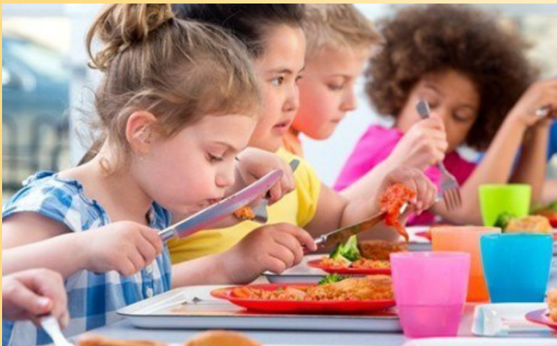
No one can learn when they're hungry. The Lunch Angel Program supports learning by ensuring EVERY student is fed.

Would you like to donate? Visit www.skpef.org