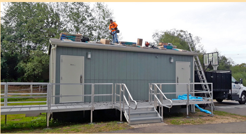
Roof replacements were made to Explorer and John Sedgwick portable classrooms.