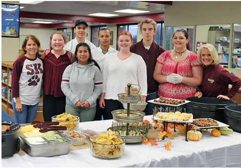
High School ProStart Culinary Arts gives students the opportunity to use their skills to cater special functions.

CTE provides an integral part of every student's education so that all students graduate from high school globally competitive for work, prepared for post-secondary education, and ready for life as positive, contributing members of a 21st century society. CTE prepares students to be beyond college ready – to be career ready.