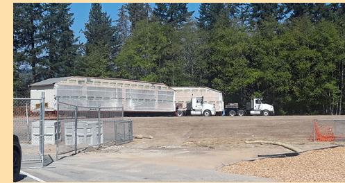
A new modular classroom unit with four classrooms and a restroom is being installed at Sunnyslope Elementary.