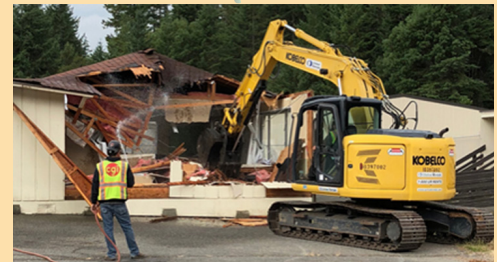
Two old Sunnyslope portables were demolished to make room for a new modular unit.