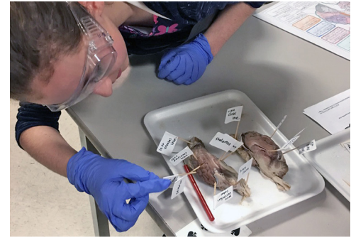
Project Lead the Way allows students to learn about brain anatomy.