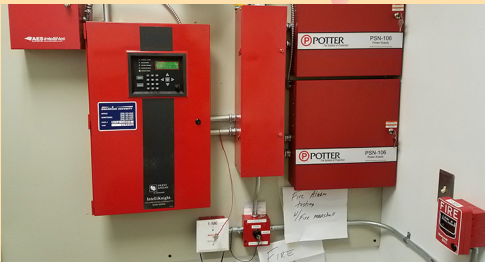
A new fire alarm system was installed at South Kitsap High School.