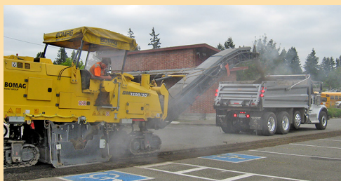
Repaving parking lots