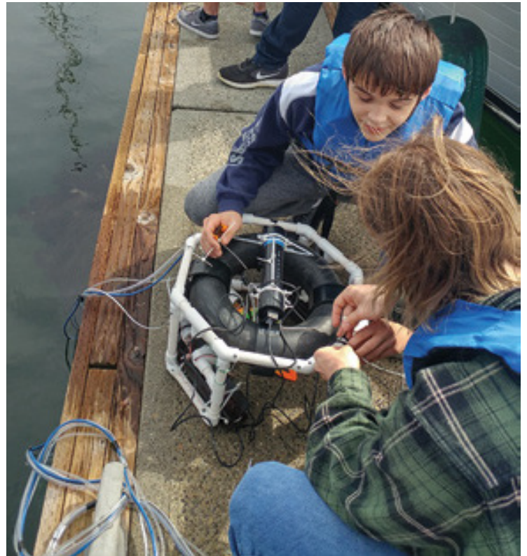
Students use remotely operated underwater vehicles (ROVs) to learn about marine life.

What attracted many students to the course is working with actual scientists. They do this in a variety of ways: trips to the University of Washington to meet researchers, visits to the class from NASA and the Johnson Space Center scientists, Skyping with scientists