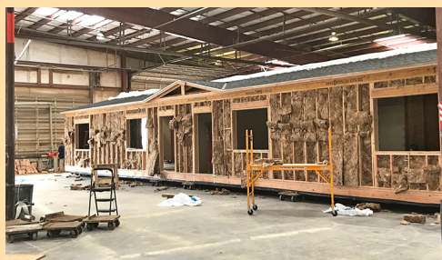
Construction of high school portables