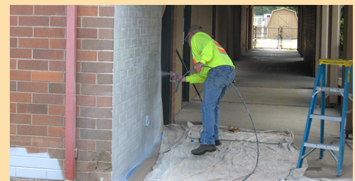
Graffiti repair - Discovery Alternative HS