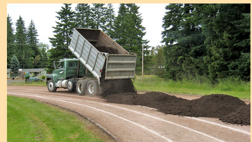
New cinders for Cedar Heights track