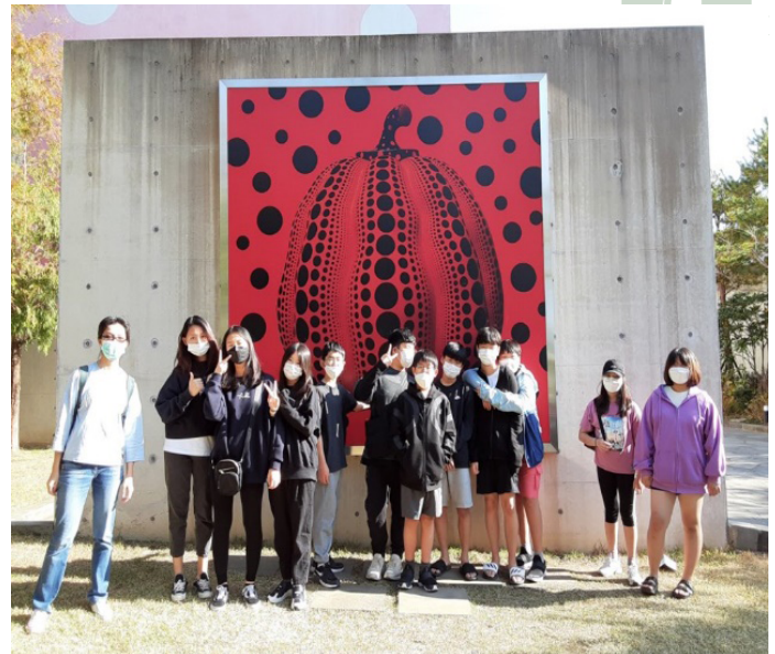
Visiting museums and art galleries

Students are playing foosball in the lobby area. Each floor has lobby area where students can play games, watch movies and hang out. The dorm also has a karaoke room in both girls' and boys' dorm. Dorm students enjoy singing and making memories with friends here. The dorm also has a pool and board game rooms where dorm students get together when they have free time.