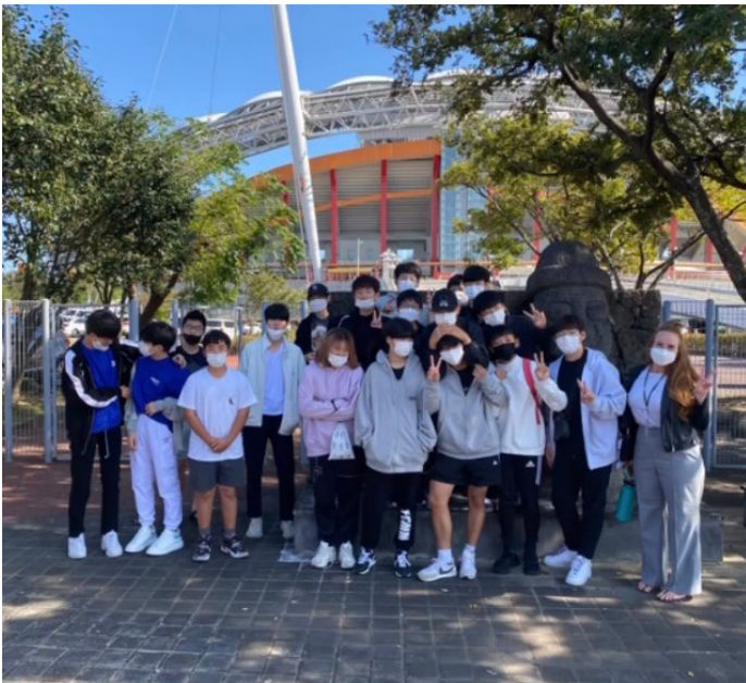
Watching sports games