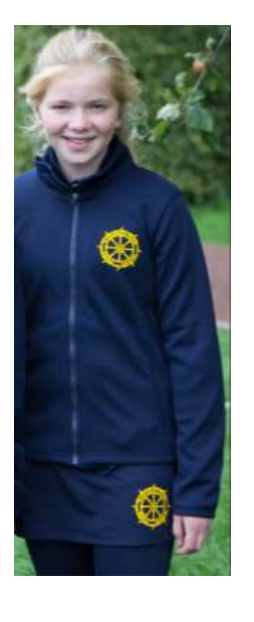
Midlayer - <u>non</u> -<u>compulsory</u> - £66 Sizes from 6 to 18 (adult sizes)