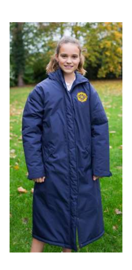
Long navy coat – <u>non – compulsory</u> - £90 Sizes from 6 to 18 (adult sizes)