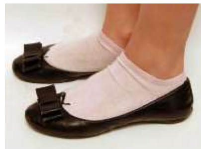
Inappropriate Footwear & Socks