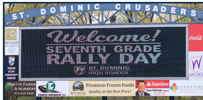
Scoreboard Ad Panel Samples