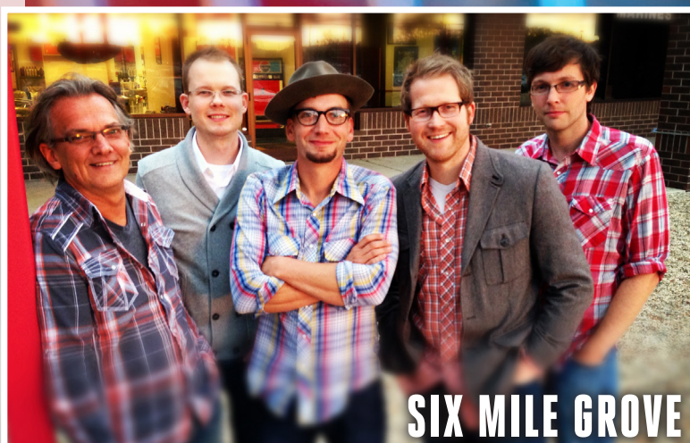
SIX MILE GROVE