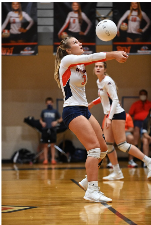
Female Athlete of the Year