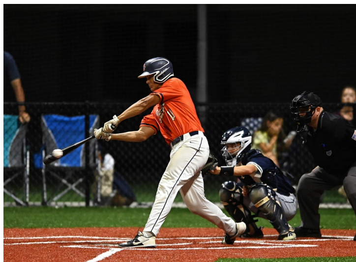
Male Son Light Award