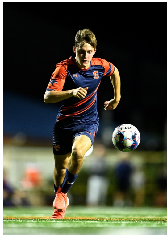
Male Athlete of the Year