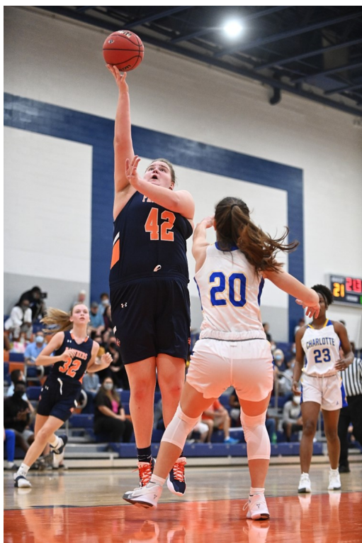
Female Son Light Award