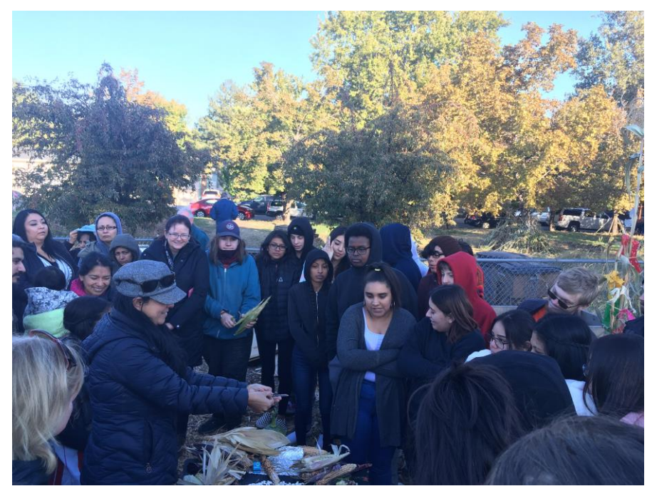
11th grade students at a community garden harvesting event hosted by Artes de Mexico en Utah.