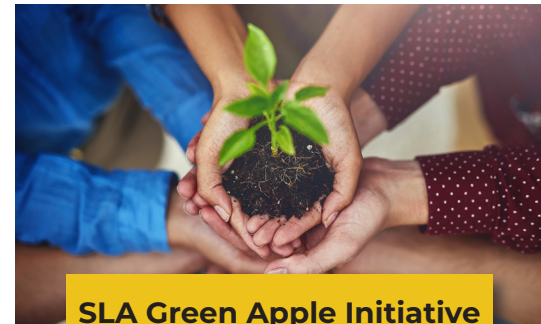
SLA Green Apple Initiative

As a family-owned company, we treat our team members, students, and school communities as an extension of our own SLA family. Our team loves what they do and are eager to greet your students daily and support them throughout their educational experience. We promise to watch over your family and feed them as if they were our own.