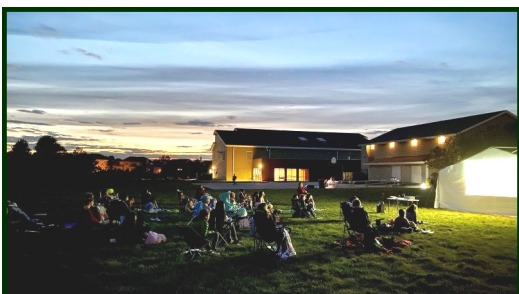
Our first-ever Outdoor Movie Night - two screens - choice of The Princess Bride or Shrek