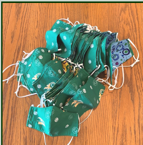
Face masks from custom Countryside logo material handmade by an anonymous family

These gestures of kindness were greatly appreciated.