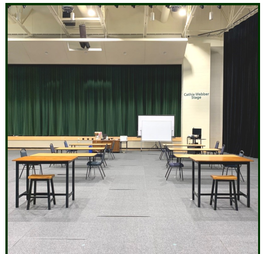
Below: LWW in the gym

ALUMNI: BE SURE WE HAVE YOUR EMAIL ADDRESS TO RECEIVE INVITATIONS