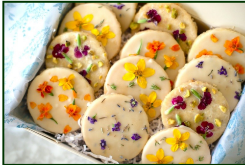
Classic Shortbread Assortment: Lemon Thyme, Pistachio, Lavender and Orange Blossom