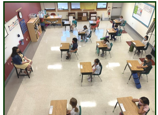
Above: 3rd grade in "old" LWW

All our faculty and staff were fully vaccinated as of the first week in March. In fact, we are fortunate to be a small school so that we could plan ahead to close the school the day after the vaccine to account for possible reactions. We are proud that our entire faculty and staff are fully vaccinated. And that we have had no cases of COVID transmission at school this year among students, faculty or staff!