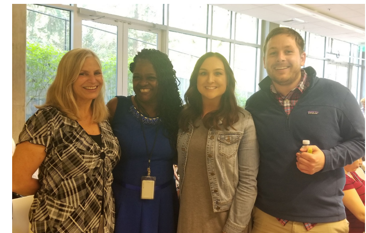
PSED staff pose for a photo at the Key Leaders event.