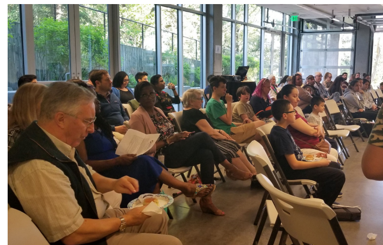
Guests listen to a presentation at the Key Leaders event.