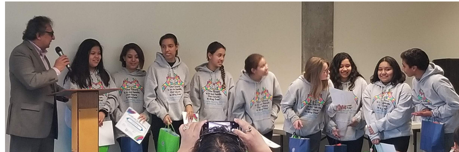
Prevention Team members show off hoodies, gift bags and Certificates of Excellence.