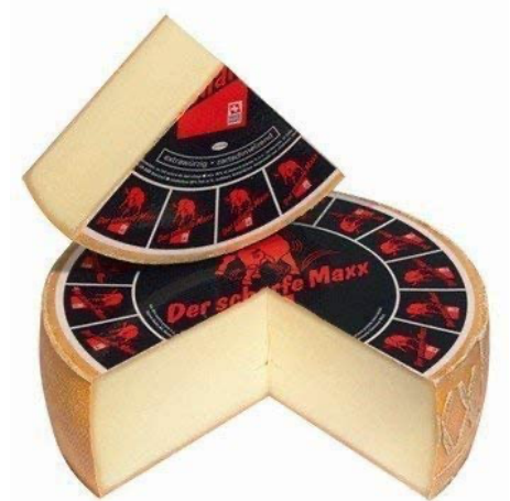
cheese & chocolate