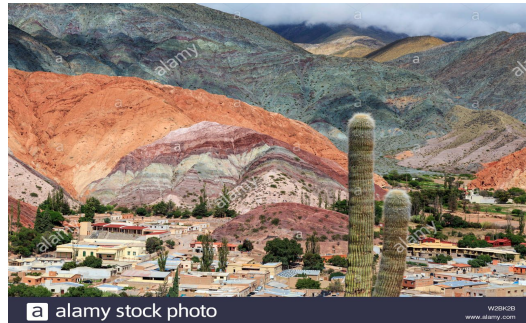
7 Colours Hill