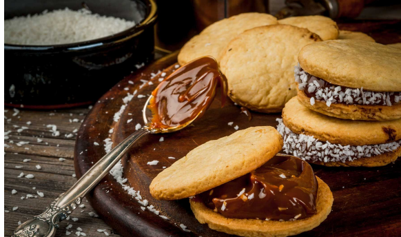
Alfajor de Dulce de Leche