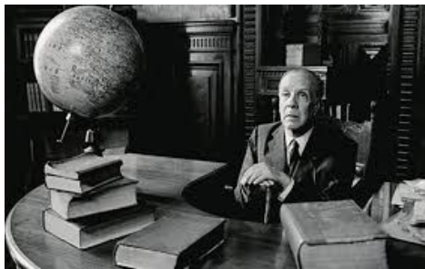
Jorge Luis Borges