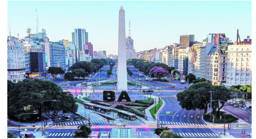
Buenos Aires City