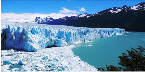
Perito Moreno Glaciar