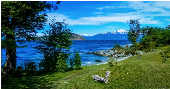
7 Lakes walk