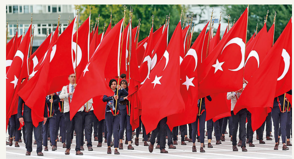
Republic Day in Turkey, 29th of October