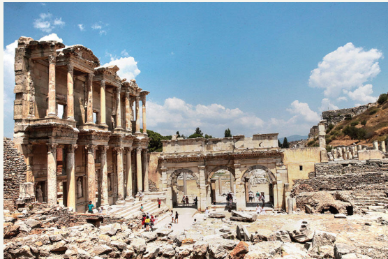
Ephesus - it is an ancient city of excavated remains from the Greek to Roman Empire