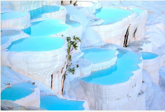
Pamukkale - thermal waters flowing down white travertine terraces

Baklava - a layered pastry dessert filled with chopped nuts, and sweetened with syrup or honey