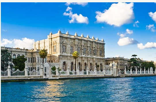
Dolmabahçe Palace - was built around 1843 and has about 39,000 google reviews now