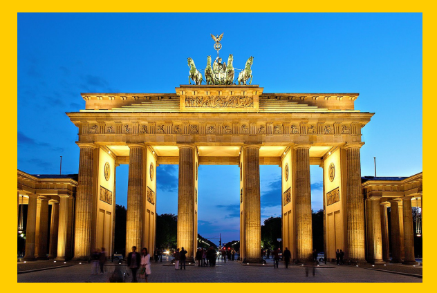
Brandenburger Gate in Berlin