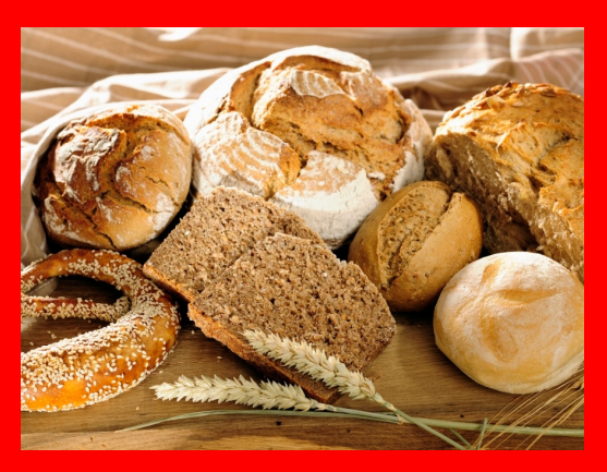
MANY different kinds of breads including pretzels!