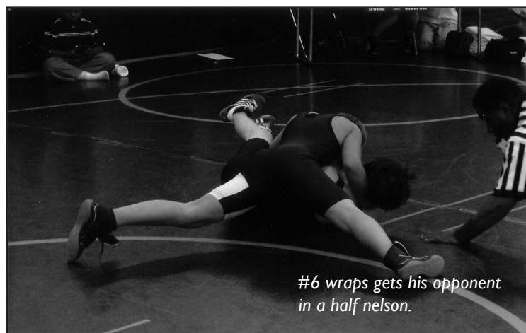
#6 wraps gets his opponent in a half nelson.