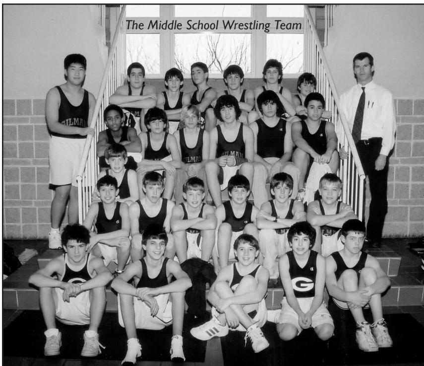
The Middle School Wrestling Team