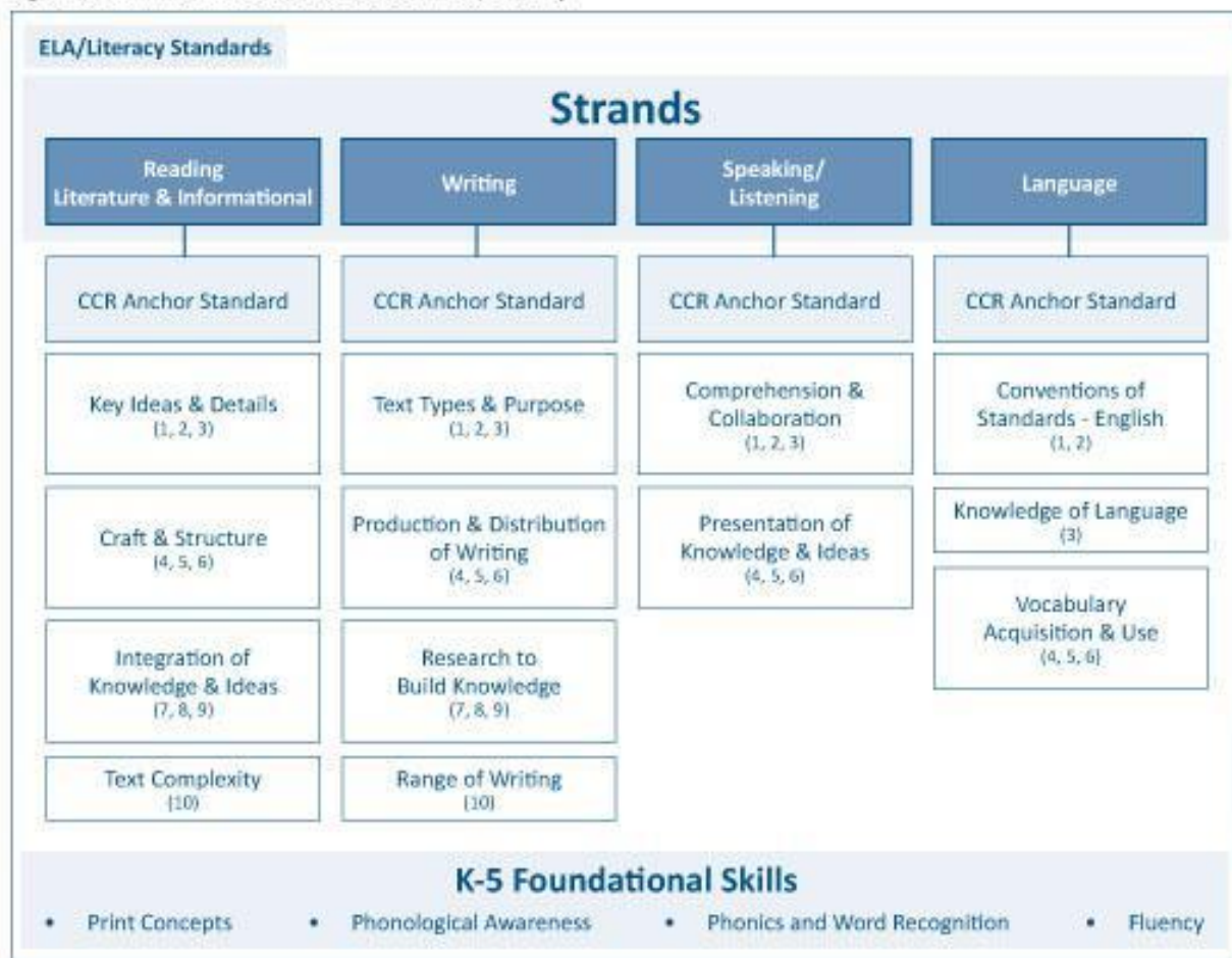
Figure 1: Common Core State Standards in ELA/Literacy

The CCSS-L is unprecedented in its unified vision of what students are expected to achieve, and the standards are more cohesive and challenging than what has typically existed before. The structure of the CCSS in English/Language Arts is comprehensive in design. There are three broad sections. A comprehensive K-5 section and a 6-12 section are specific to English Language Arts, and cover Reading, Writing, Speaking and Listening, and Language. The K-5 section also includes foundational skills. The third section, Literacy in History/Social Studies, Science, and Technical Subjects, 6-12 consists of Reading and Writing strands. Teachers with content area expertise help students meet the challenges of reading, writing, speaking, listening and use of language in their respective fields. The figure below illustrates these dimensions.