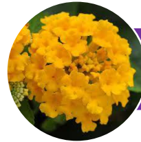
Little Lucky Yellow