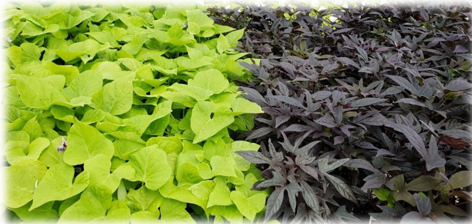
New Solar Power