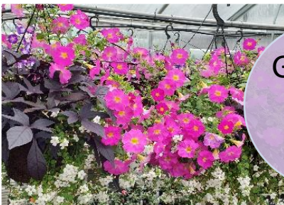
German Style Purple