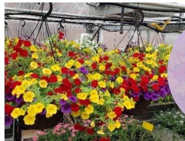
Sprinkles on Top