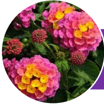
Little Lucky Hot Pink

This plant loves the sun and heat and provides a delicate pop of color to any pot or border in the flower bed. This plant will bloom all summer into fall. It grows in a mounding habit and will look great wherever it is planted.