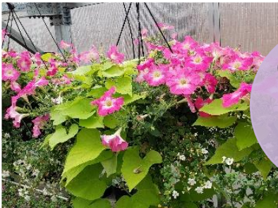
German Style Green

All these baskets are sun loving basket combinations. Many are combinations that we have planted in the past and some are new varieties based on customer feedback. You will order these by their name in the online order form. Plants: Mixmaster varieties, bacopa, wave petunias, petchoa, verbena calibrachoa, potato vine.