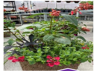
Red & Orange