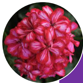
Ivy Geranium Focus Red Ice