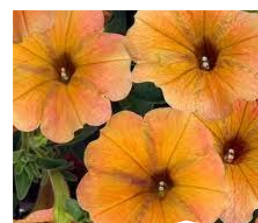
Cascadia Indain Summer