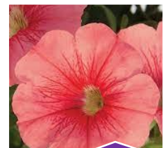
Salmon Red Vein