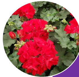
Fantasia Cardinal Red