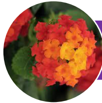
Little Lucky Red