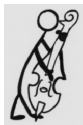
DOUBLE BASS (Bass for short)