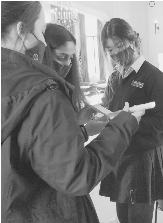
LCA hosting second workshop