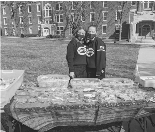
Quad bake sale!