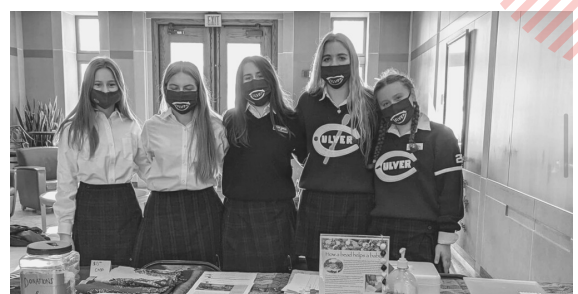
Winter bracelet sale

Throughout the winter, we have had many beading sessions where members of LCA come together to help make bracelets. The Amani Children's Foundation is a partner foundation of the Leadership Committee for Africa here at Culver Academies. They care for orphaned children in Kenya, and every one thousand dollars donated supports a child for a year. One way to raise money for the partner organization is through purchasing bracelets. Some of our bracelets consist of clay Kazuri beads, hand made, along with other beads. The beading sessions are great opportunities for members of LCA to come together, as well as, raise money for a good cause. We have successfully sold many of these homemade bracelets during a winter beading sale.