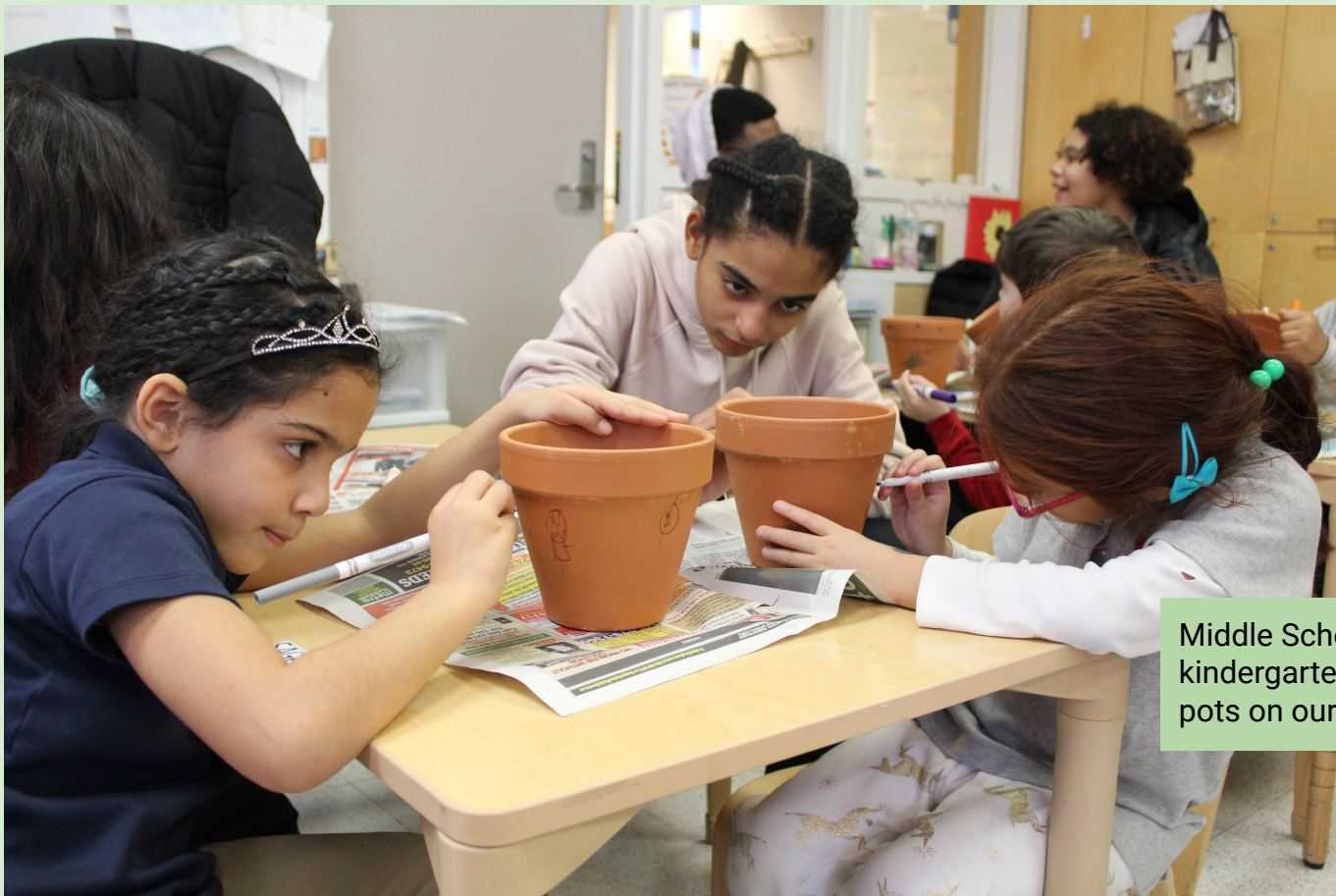
Middle School students join kindergartners to paint flower pots on our MLK Day of Service