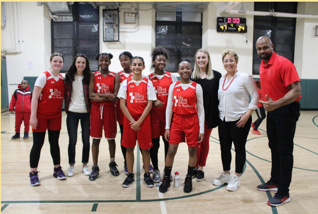
The 2019-20 Girls Basketball team made it to the MSAL finals