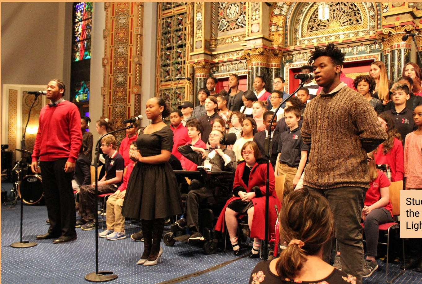
Students performing at the annual Peace and Light Ceremony