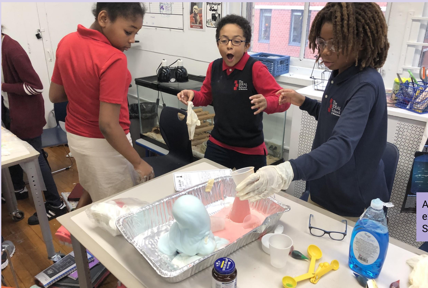
A hands-on experiment in Middle School science