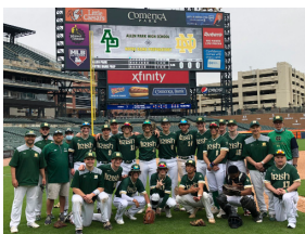
The Notre Dame Varsity Baseball team earned a 7-1 win over Allen Park in a game played at Comerica Park