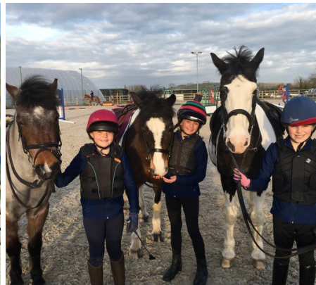
Three little girls who love their ponies lots!