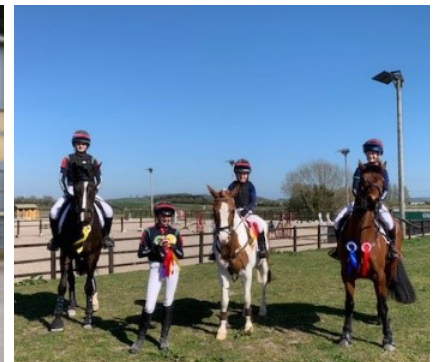
Congratulations to our Hickstead qualifiers!