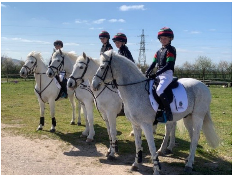
Congratulations to our Hickstead qualifiers!