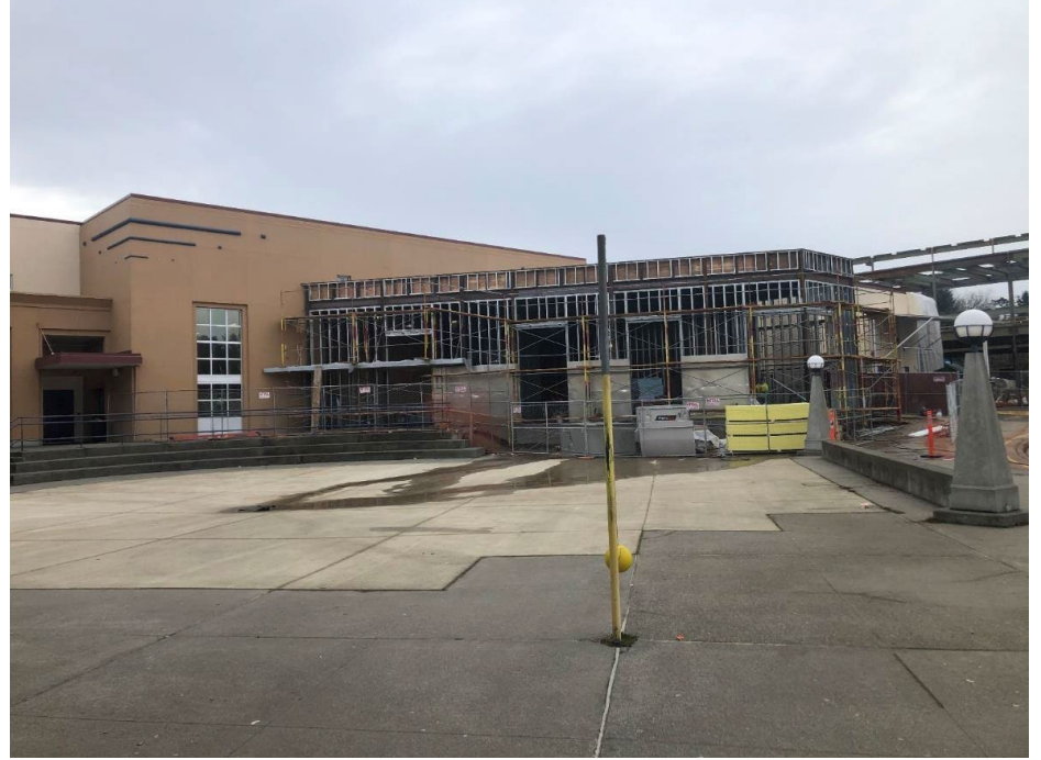
North elevation of the commons expansion (Area A).