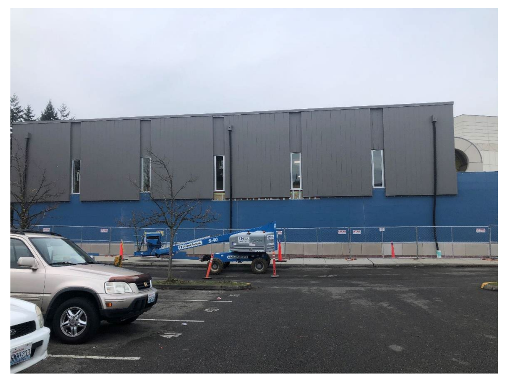
East elevation of the new auxiliary gym, Area J, where the siding materials for the exterior are now being finished.