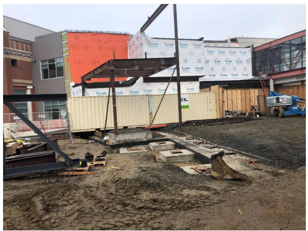
Looking west across Area F footings at Area E. In the center of the photo, a container has been brought in as a pedestrian tunnel for protection from overhead work.

Interior of the pedestrian tunnel protecting the walkway between construction of Areas E and F.