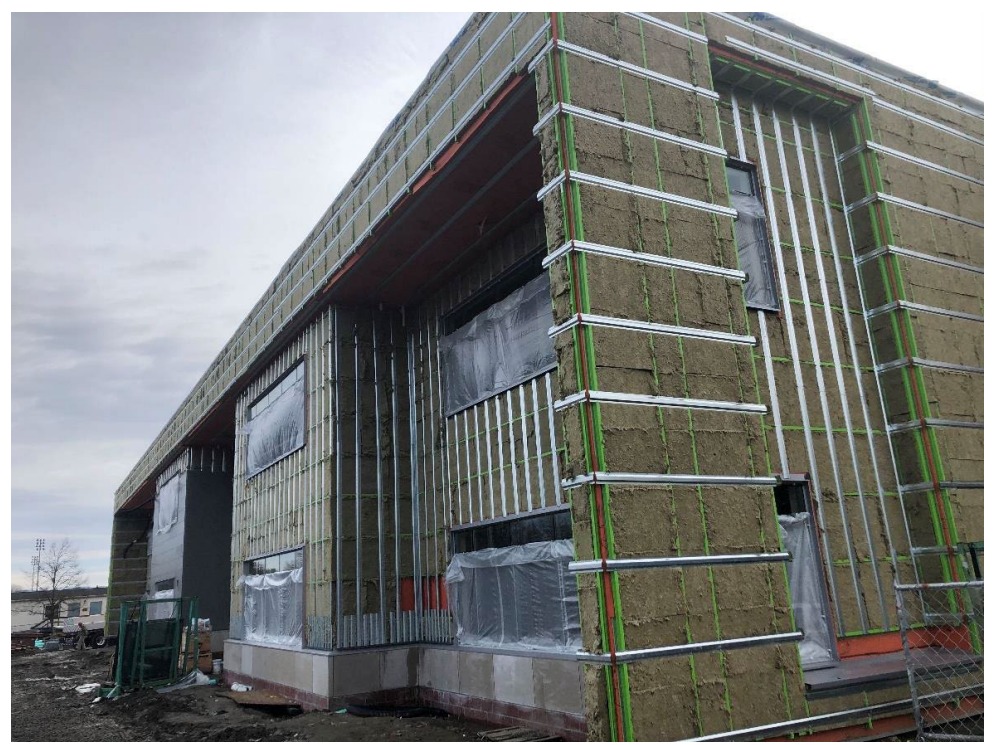
Northwest elevation of the exterior of Area A addition