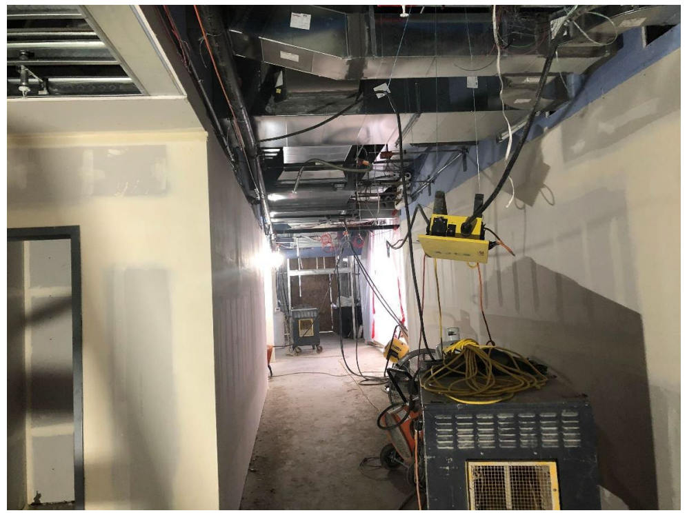
Eastern end of the east-west hallway on the first floor of Area A – looking easterly.