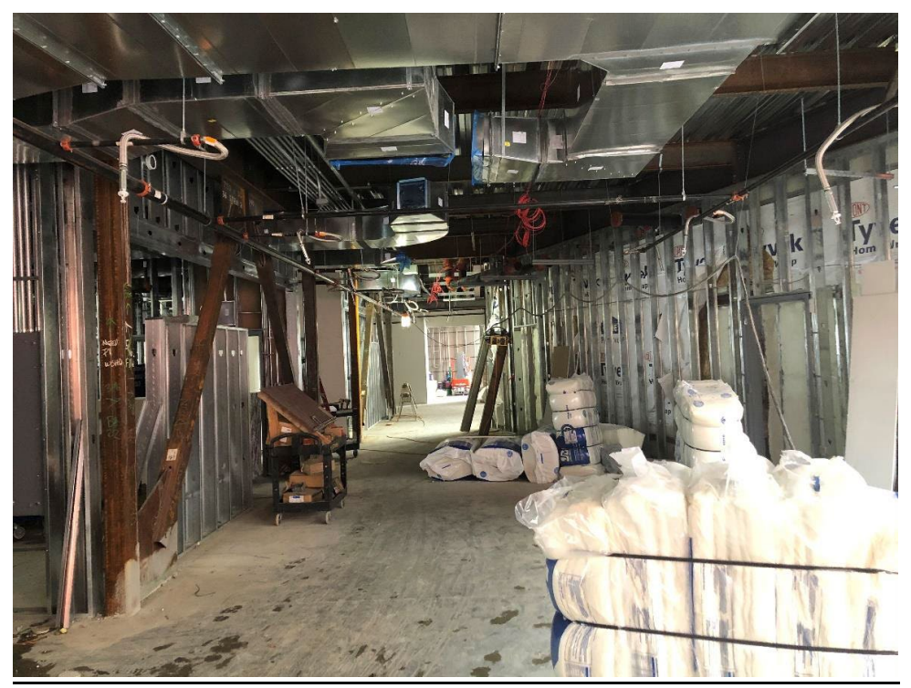
Second floor hallway in Area B where insulation is underway, and MEP is roughed in.