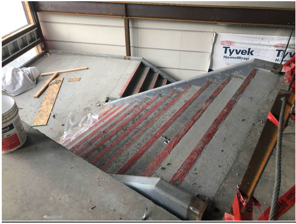
Area B southeast stairway treads with concrete poured and curing.