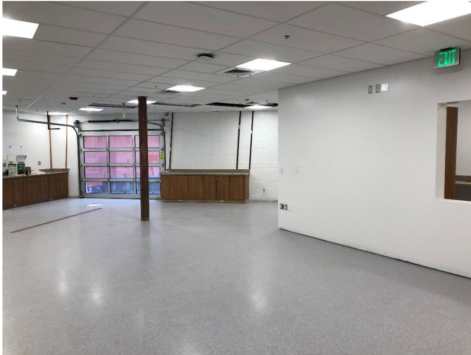
West half of new art classroom 140, nearing readiness.