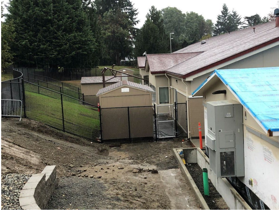
Cascade View: Looking east across the back of E Wing where the new Tuff sheds have been installed.