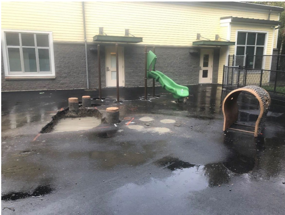
Tukwila: Progress in the new playground equipment area.