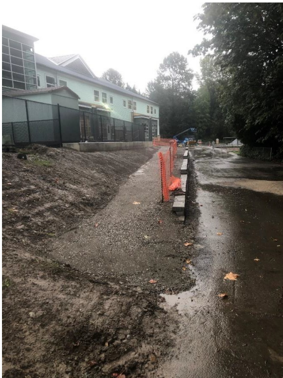
Thorndyke: South side of school, where retaining walls, bio retention structure, and landscaping work remain to be completed.