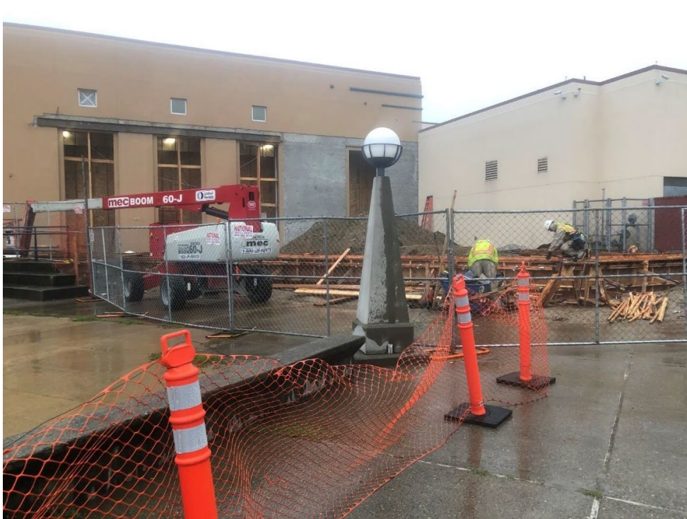
Overview of the construction zone for the commons expansion, as seen from the bus loop.