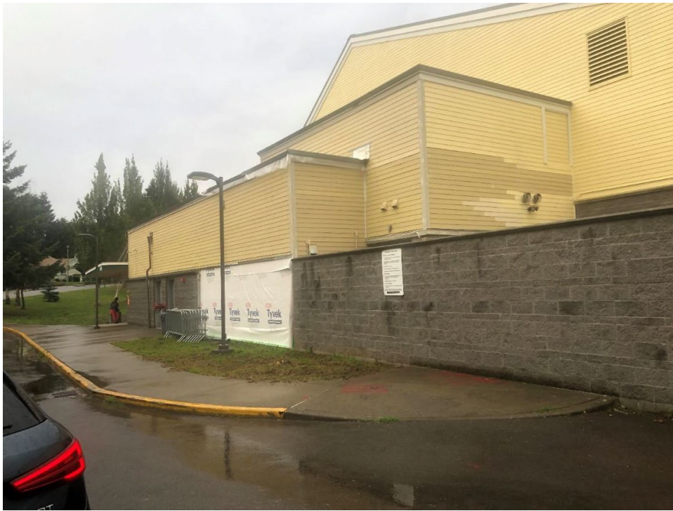
Tukwila: West exterior wall that was rebuilt to alleviate dry rot, now receiving siding and finish work.