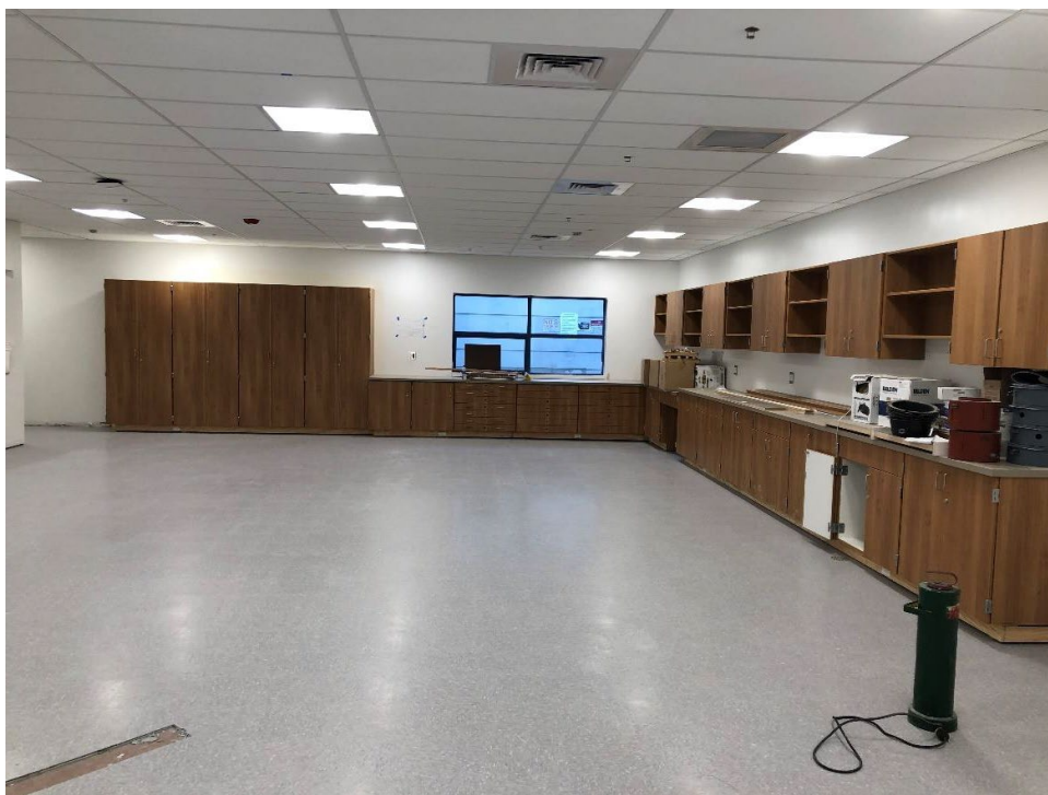
East half of the new art classroom 140.