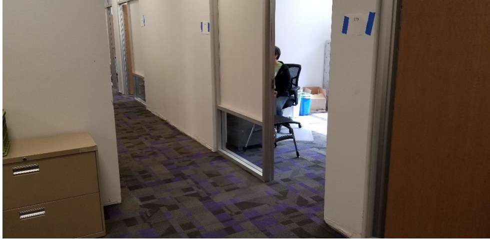
Area C – Carpet tile has been installed throughout Area C, minus room 145, which also has luxury vinyl tile (LVT). Rubber base still needs to be installed.