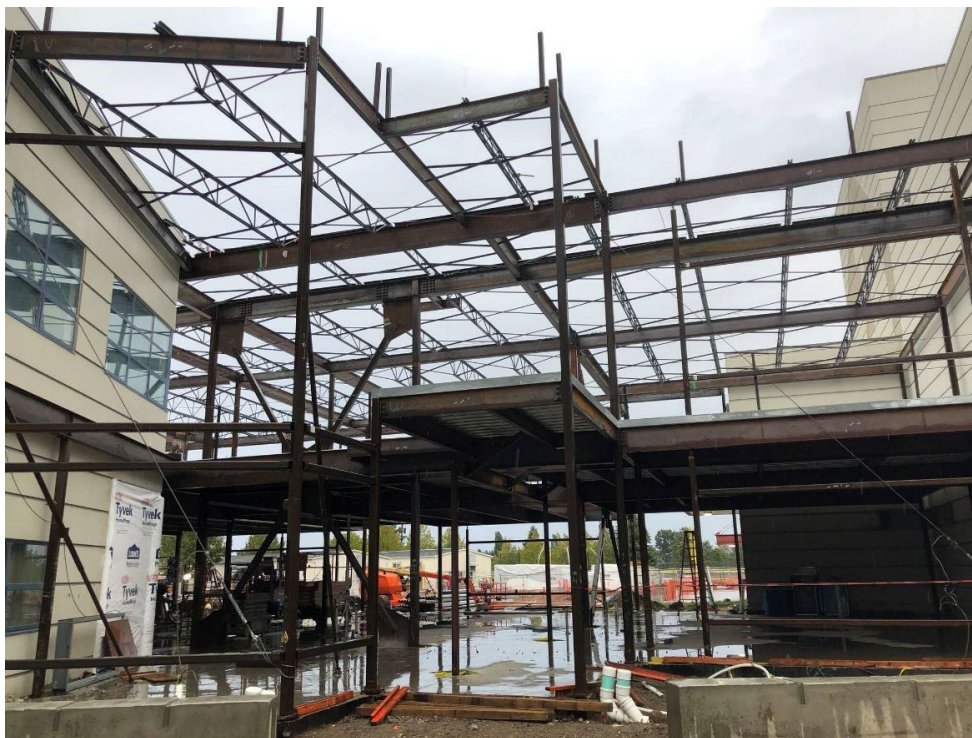
Area B Structural steel, looking north from the open area just north of the connecting structure between the academic and activities wings.