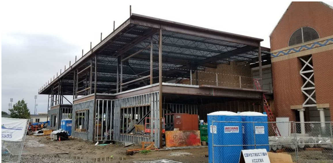
Area A (North side of Academic Building) – Metal stud framing is ongoing.