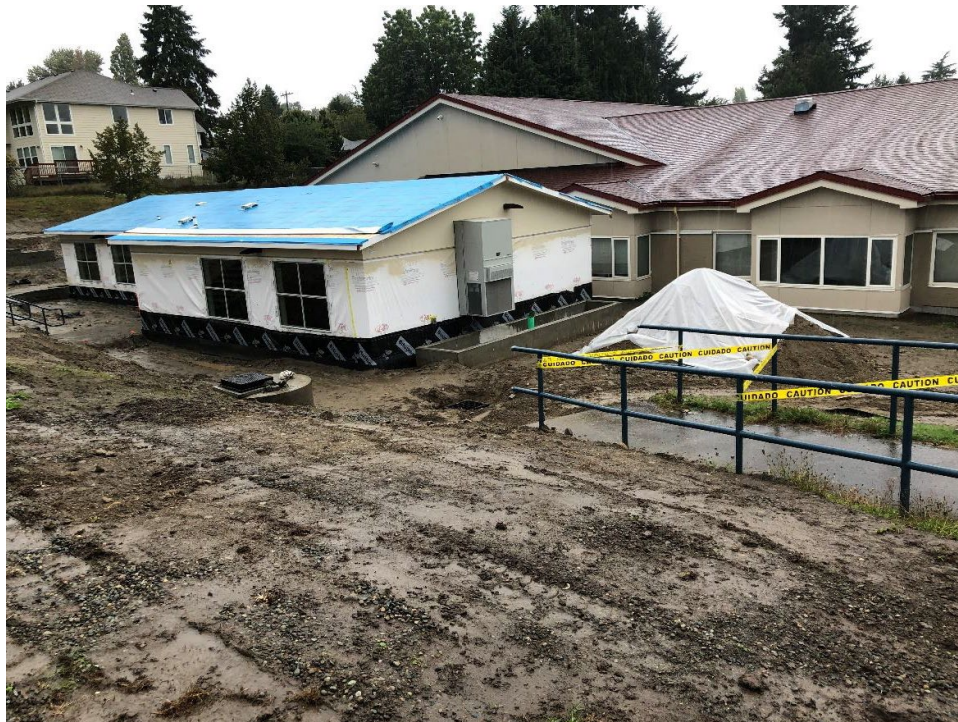
Cascade View: Looking northeasterly across the new north modular building. Significant work remains on the building and landscape.