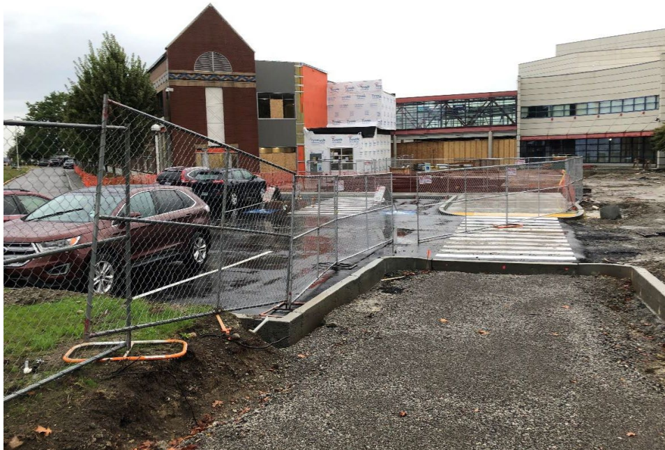
Area E – Administration Area. Looking north across the main campus entry parking lot. Area E administrative wing expansion is in the left center, and the foreground is visitor parking and crosswalk.