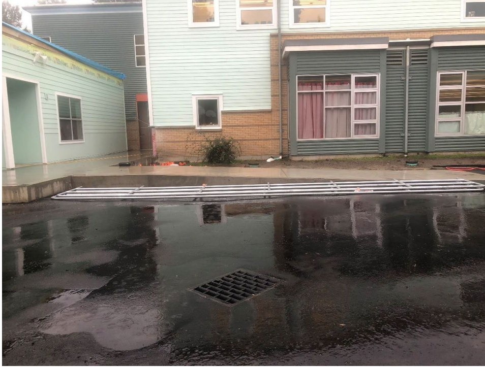
Thorndyke: Looking south from the paved play area on the east side of the school toward the accessible ramp entering the new modular classroom building (left).