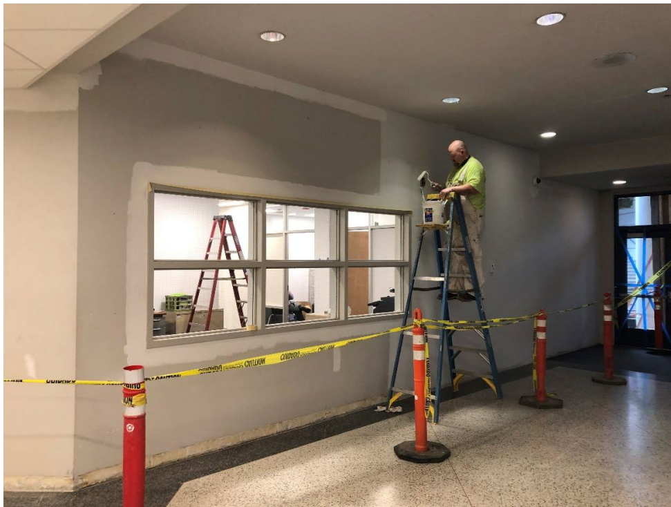
Area C – Painting in the main entry hallway of the academic wing just outside of the new counseling center.