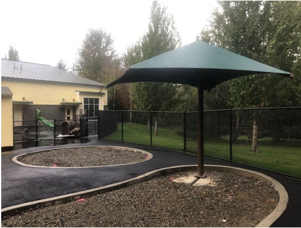
The new playground area behind the east portion of the school. Construction in progress.