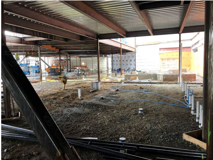
Area A – Standing under the eastern portion of the first floor of Area A, looking southeasterly to the courtyard, and on the left, Area B structure.