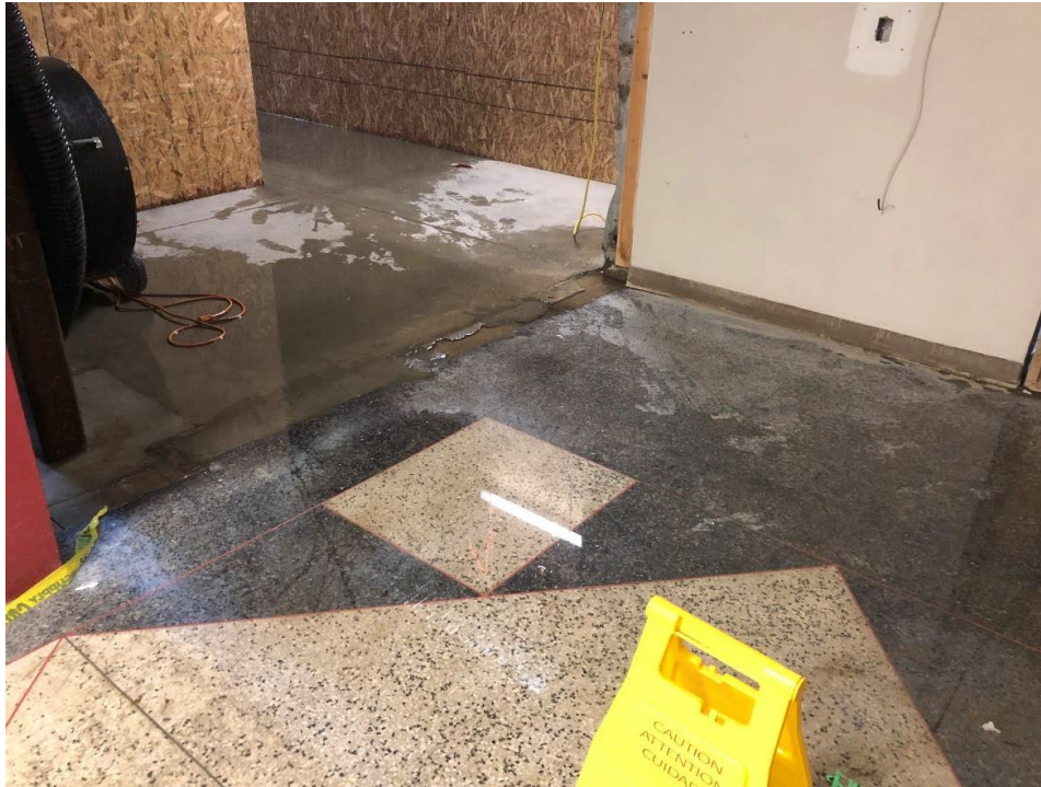
Area A – Rain has intruded through the open space between the academic wing and new Area A stairwell construction. The team worked to get the area covered to prevent more, and make the areas impacted safe from slippery conditions.