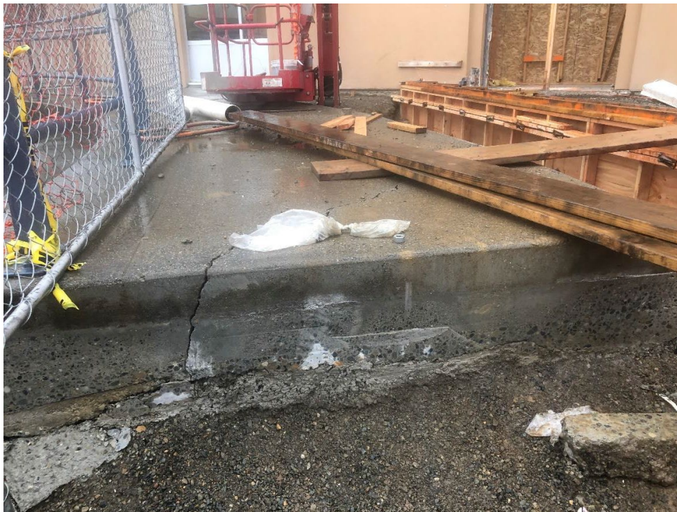
Portion of commons flatwork damaged by impact while preparing footings for the commons expansion.