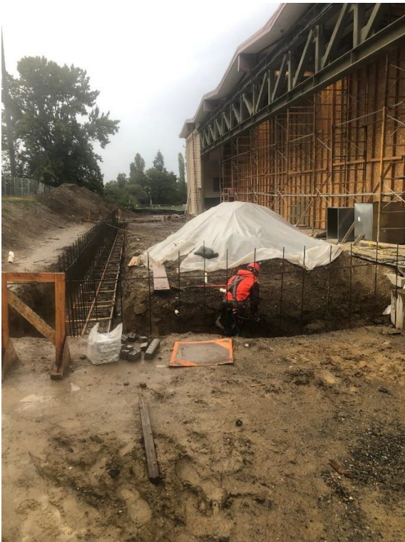
West wall of the gymnasium (looking north), now fully supported on the new girder/truss and support columns. In the left center of the photo, the new strip footing is going into place for the expansion.