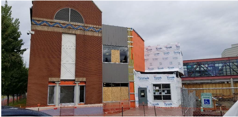
Area E – Administration Area. Casework is 98% complete, missing some hardware and edge banding. The area has roughly 15-20 ceiling tiles that are water damaged and need to be replaced.