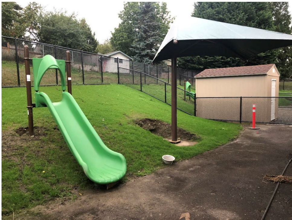
Cascade View: Center play area behind E Wing.