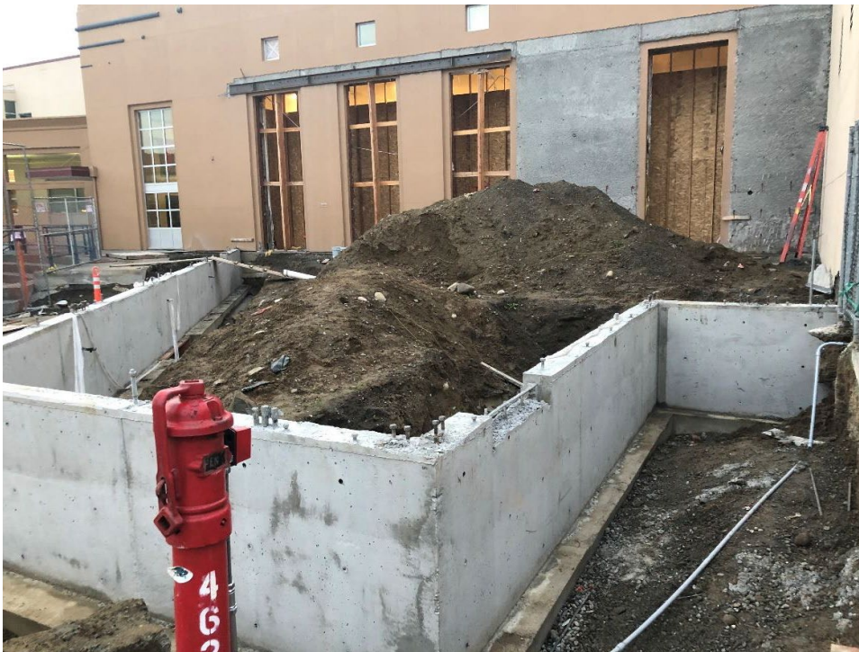
Overview of construction zone for the commons expansion, where footings and stem walls are poured, and the slab is scheduled for next week following backfill.