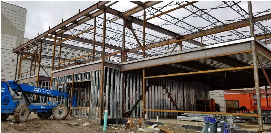
Area B – Steel erection is ongoing. Metal stud framing is ongoing.