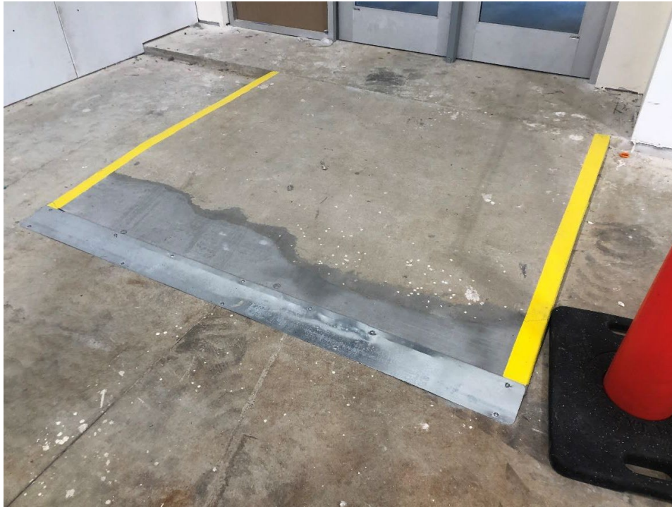
End of ramp into gymnasium, modified for smooth passage by wheeled equipment and wheelchairs.