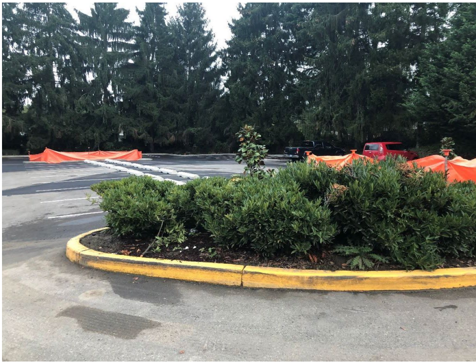
Thorndyke: Parking lot west of school building. Orange fencing is delineating the locations of the new light poles.