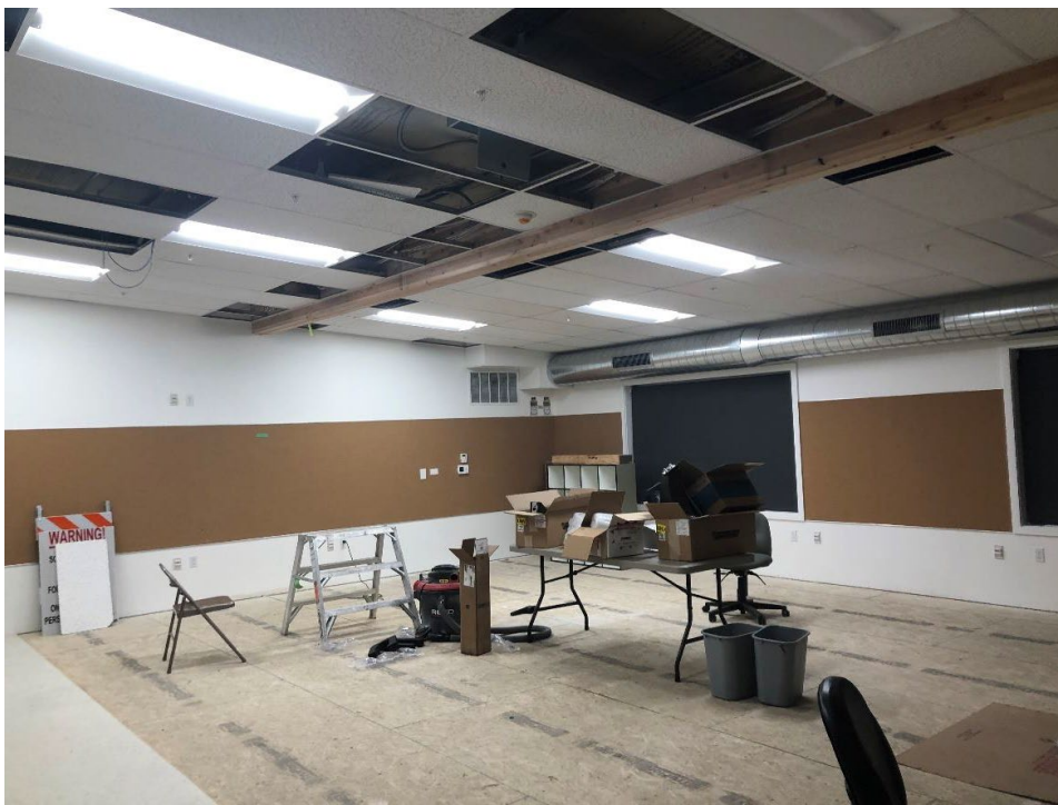
Tukwila: Inside one of the two new modular classrooms.