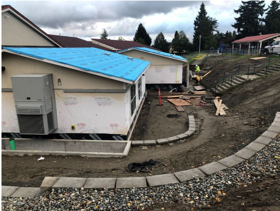
Cascade View: Looking south across the back of the new north modular building. Work remains on the building and landscape.