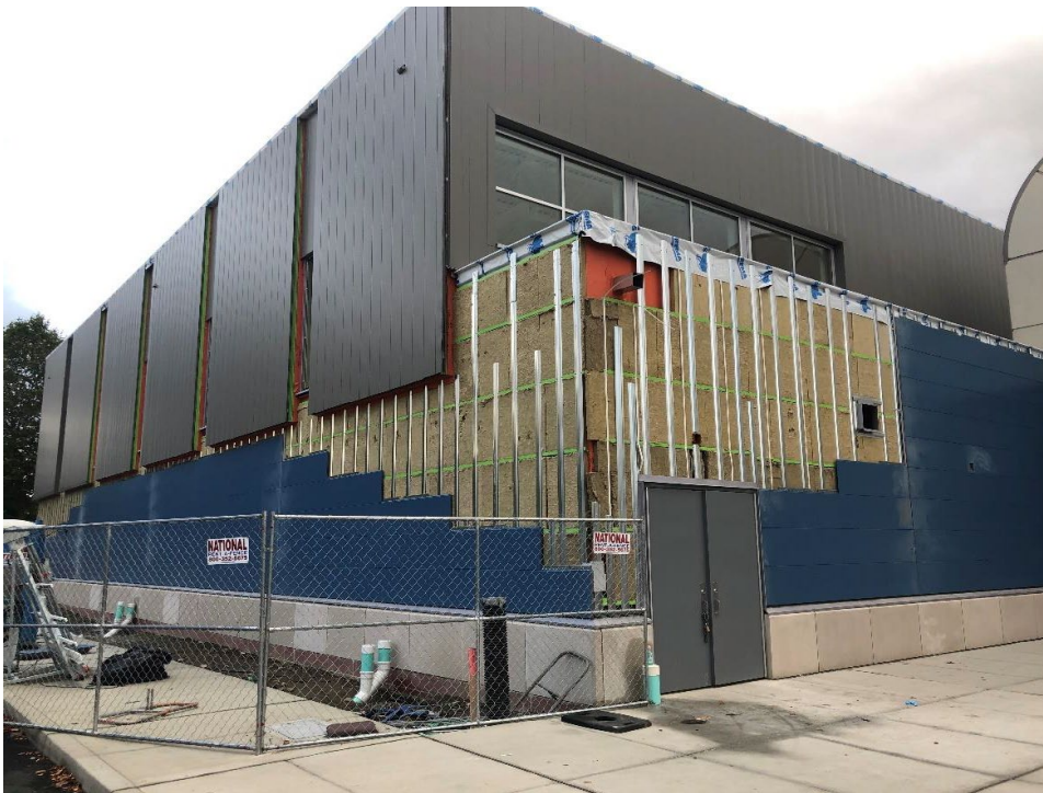
Area J - Northeast corner of new gymnasium where the exterior continues to have siding installed.