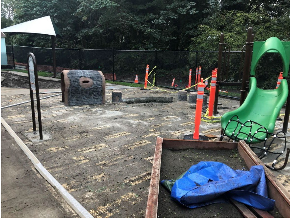
Thorndyke: A portion of the new playground equipment installed behind the school.