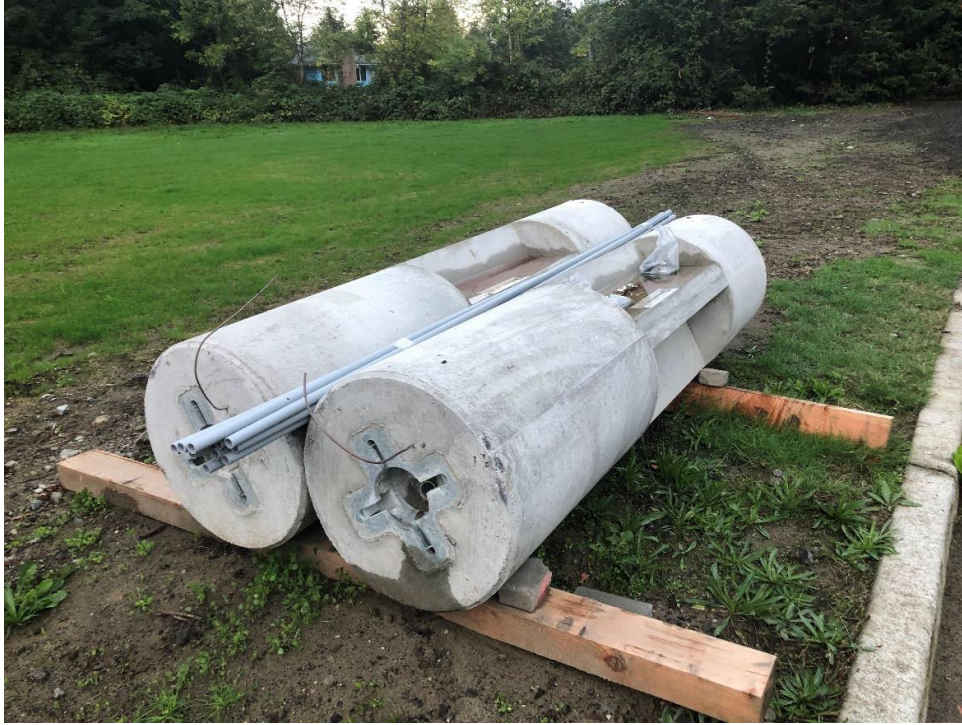
Thorndyke: New light pole bases to be installed in the parking lot.