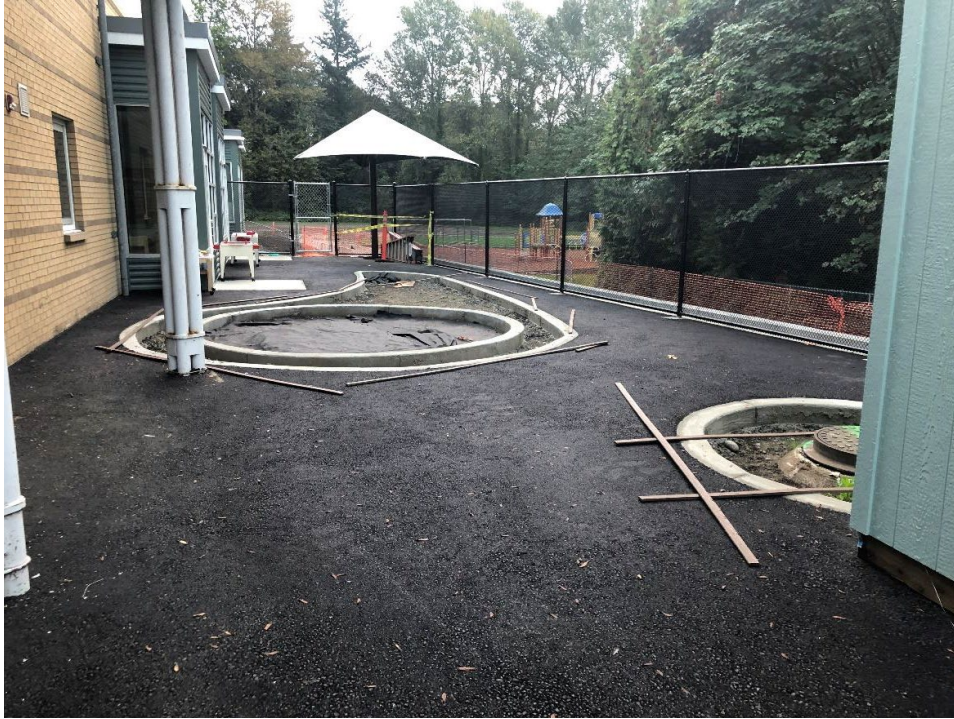
Thorndyke: Easternmost section of the new playground areas.