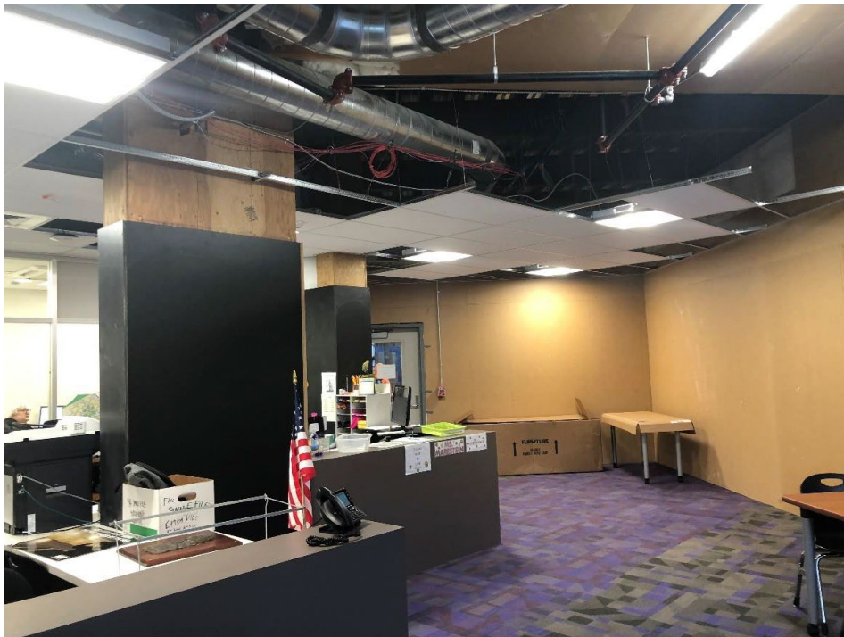
Area E – Work continues in the new main office reception area.