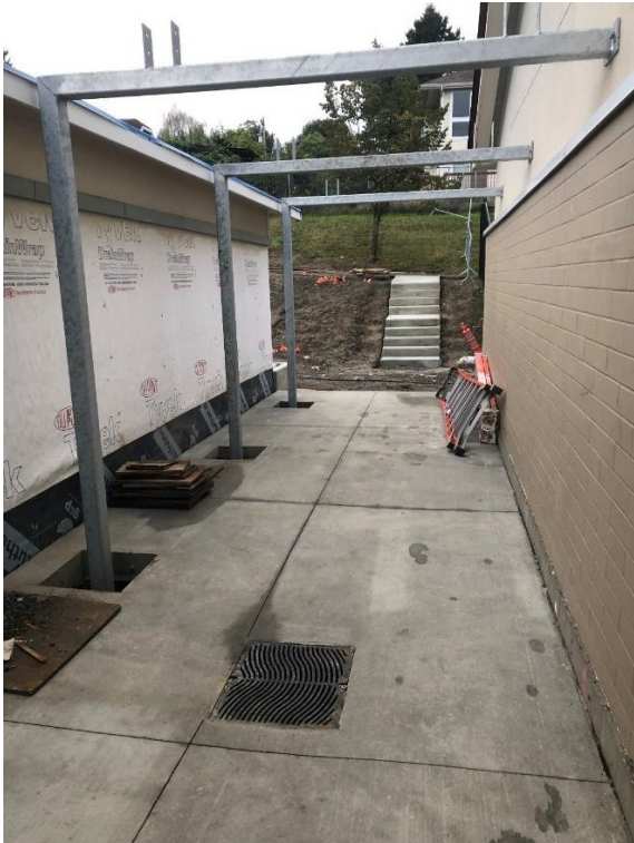
Cascade View: Framing for covered walkway between the west wall of E Wing and the east wall of the new modular.