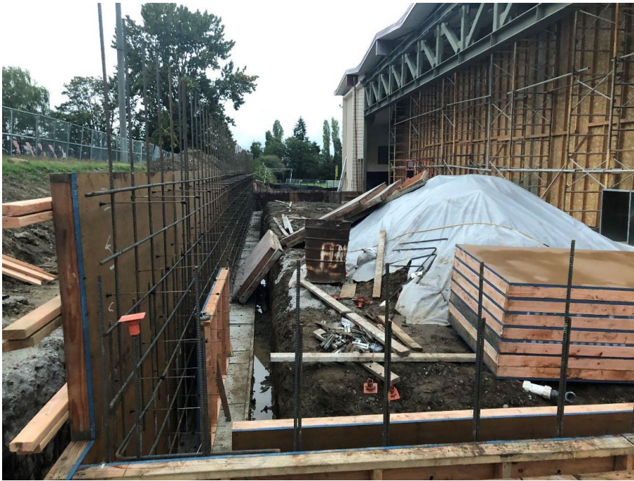
Construction zone for the gymnasium expansion to the west, where walls are now being formed and steel reinforcement placed for a concrete pour.