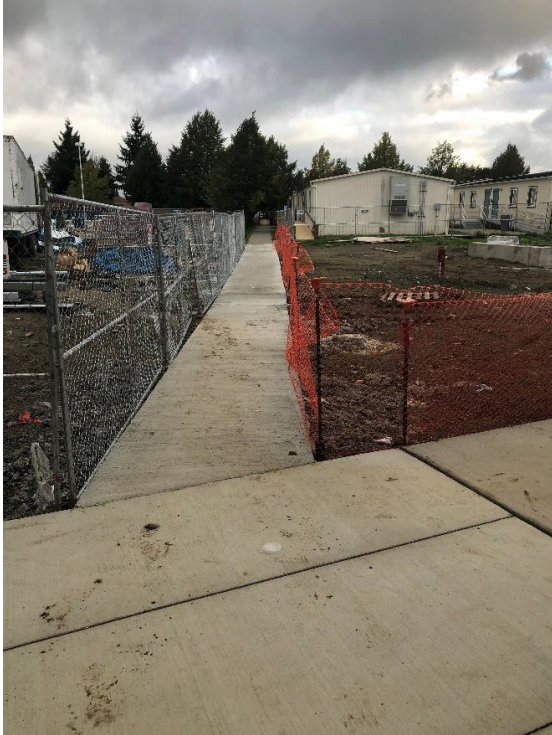
Sidewalk connecting portables north of the main school building to the activities wing. Contractor will be moving the fences outboard and place a solid surface for wider passage.