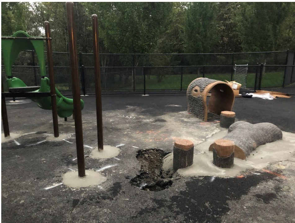
Tukwila: A portion of the new playground area.