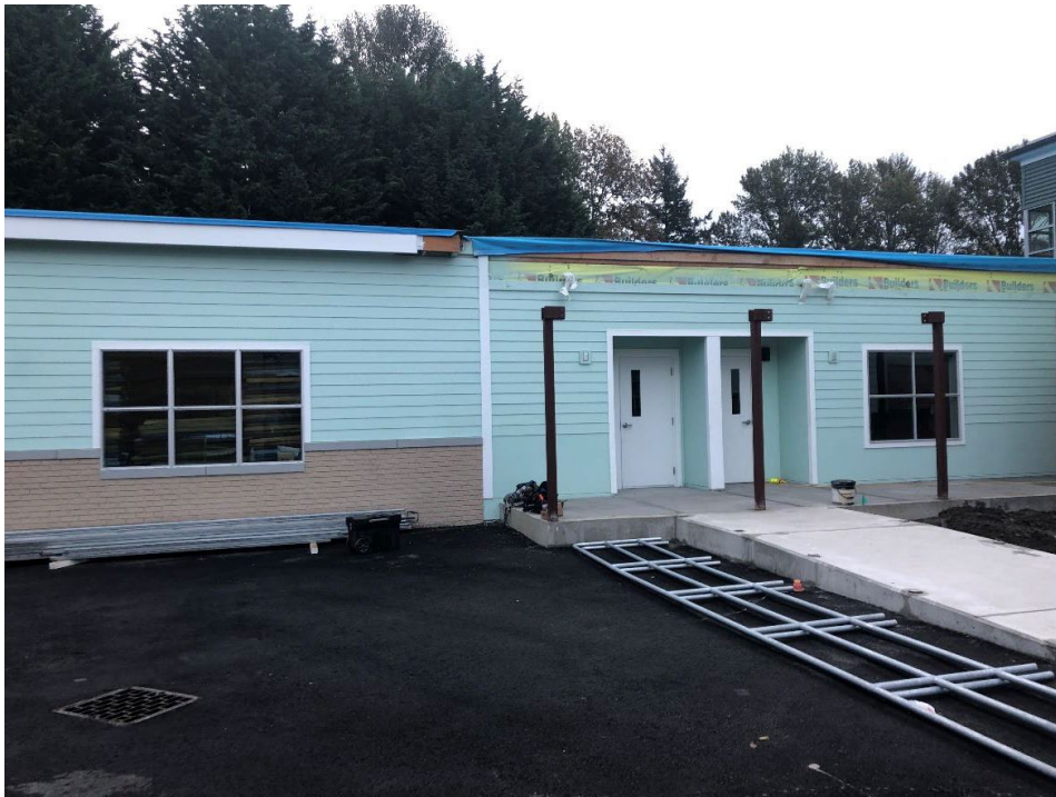
Thorndyke: West elevation of new modular building, with canopy steel posts now inset in front.