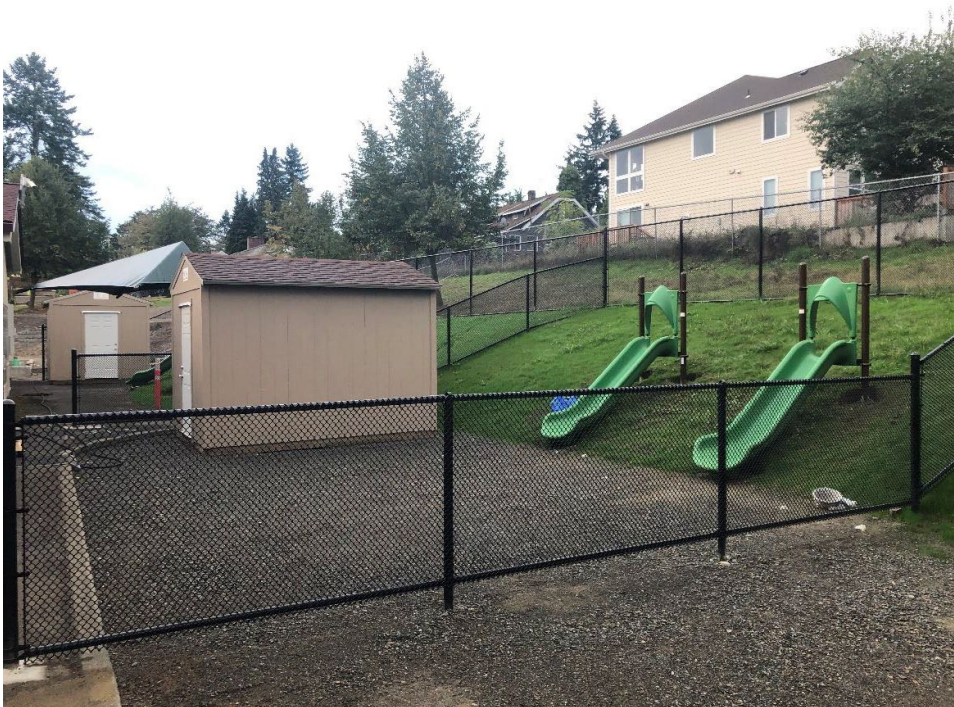
Cascade View: Play area north of E Wing.