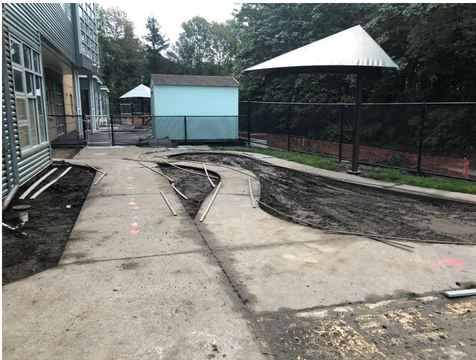
Thorndyke: More of the playground area still under construction.