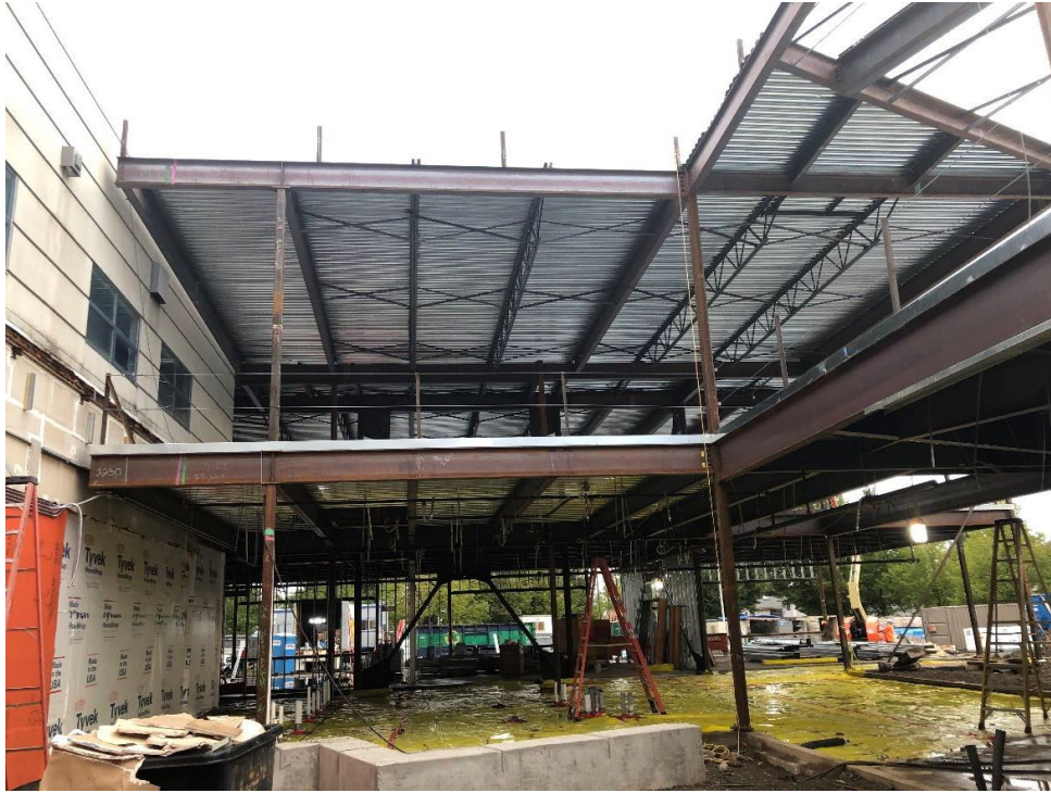
East portion of the new A wing, as seen from Area B, looking north.