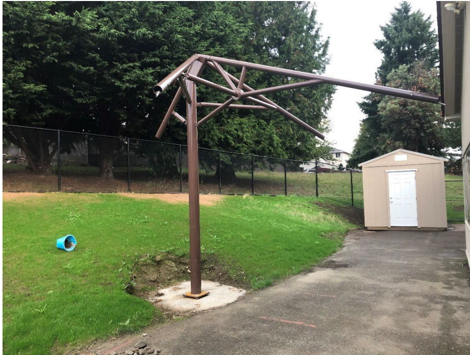
Cascade View: Play structure cover frame inset into slope on north side of E Wing.