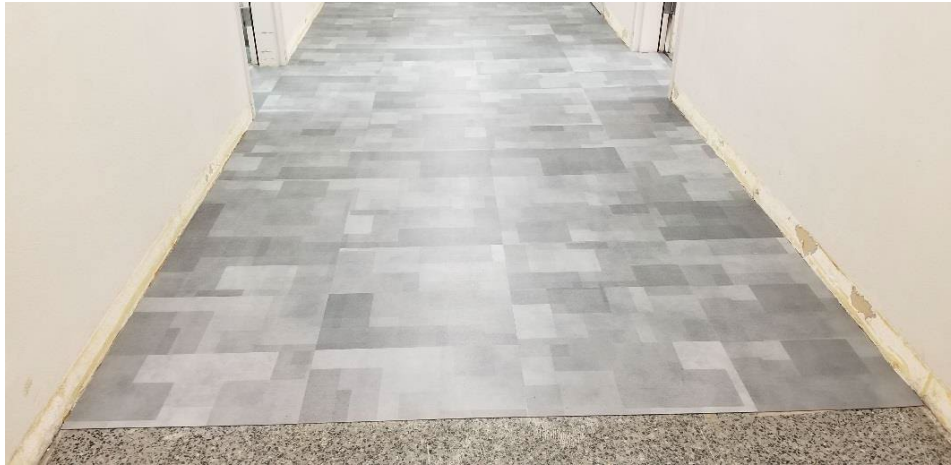
Area C – Luxury vinyl tile installation has begun in Area C corridors, rubber base still needs to be installed.