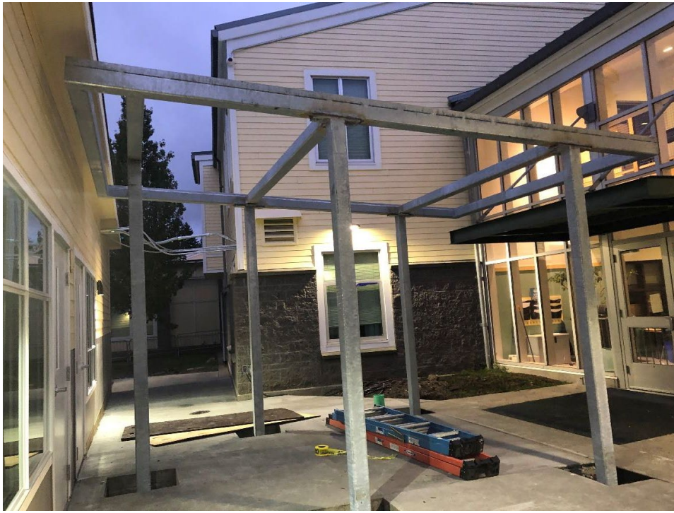
Tukwila: New canopy structure being installed between the new modular classroom building (left), and main school building (right).