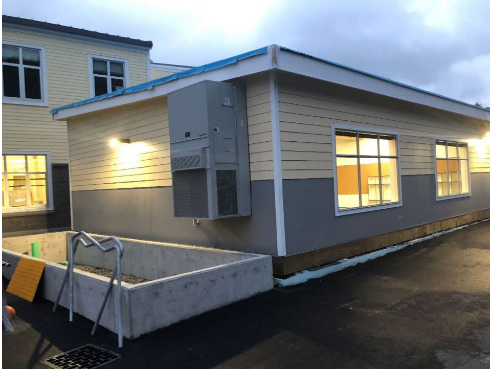
Tukwila: New modular classroom building's southwest elevation.