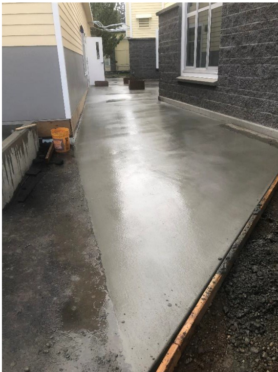
Tukwila: Space between the new modular building on the left, and the existing school on the right, with the concrete slab and sidewalk area poured. A canopy will cover the walkway between the two separate buildings.