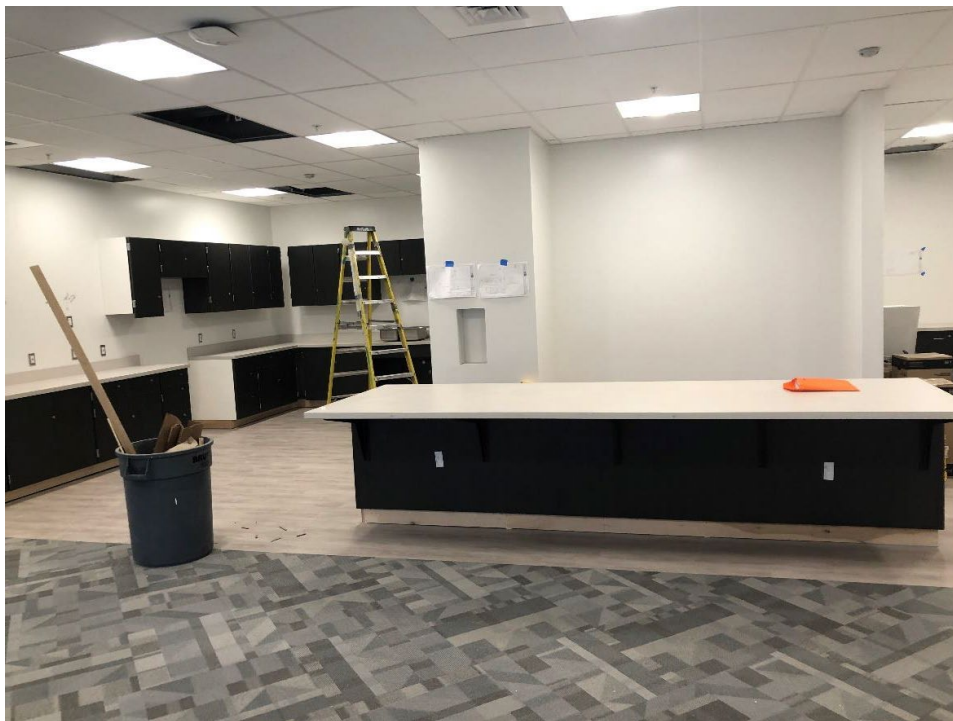
Work continues in staff lounge on the 2 nd floor of new Area E.