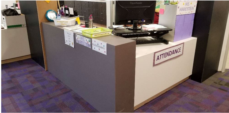
Area E – Administration area casework is 99% complete, missing some hardware and edge banding. Carpet is installed throughout, still needs rubber base.