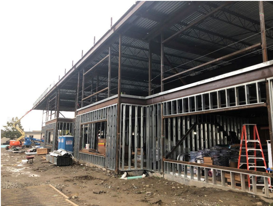
Area A – North elevation of the new Area A, looking southeasterly. Work is progressing on the parapet wall above the second floor roof.