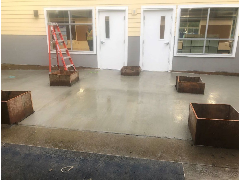
Tukwila: Covered walkway area under construction, providing access to new modular classroom building, where a canopy will soon be built to provide cover for the students.