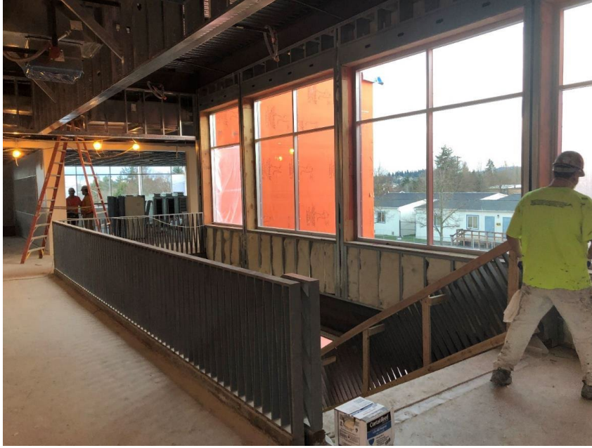
Top of the stairway seen in A.6.5. above.