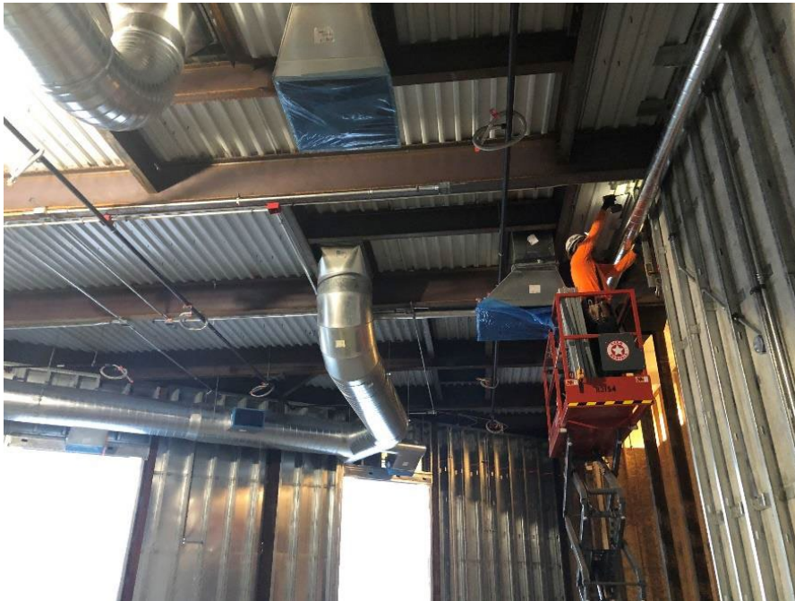
Worker installing ductwork in the interior space of the Commons Addition (Area A).