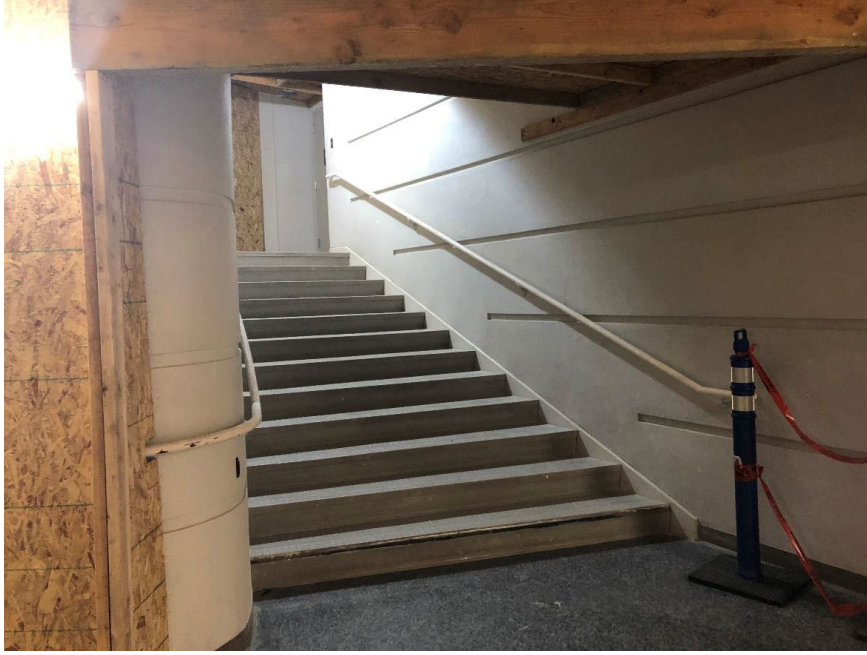
Re-opened egress from the PAC, being provided as emergency egress.