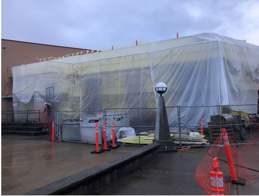
Commons Addition (Area A) covered with plastic for working on the exterior during rain.