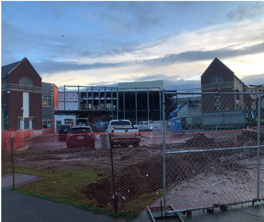
Current view of the southwest elevation at the entrance to FHS as seen from the corner of 144th and 42nd. Workers installing ceiling grid in a second floor classroom in Area A addition.