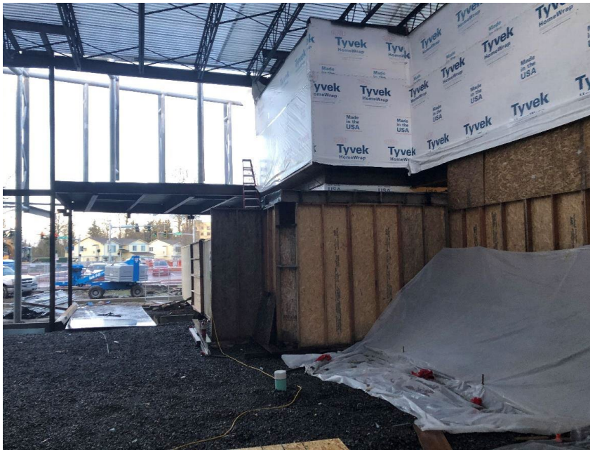
A portion of Area F (commons and food service) looking outward from the back of the remodeled commons area.