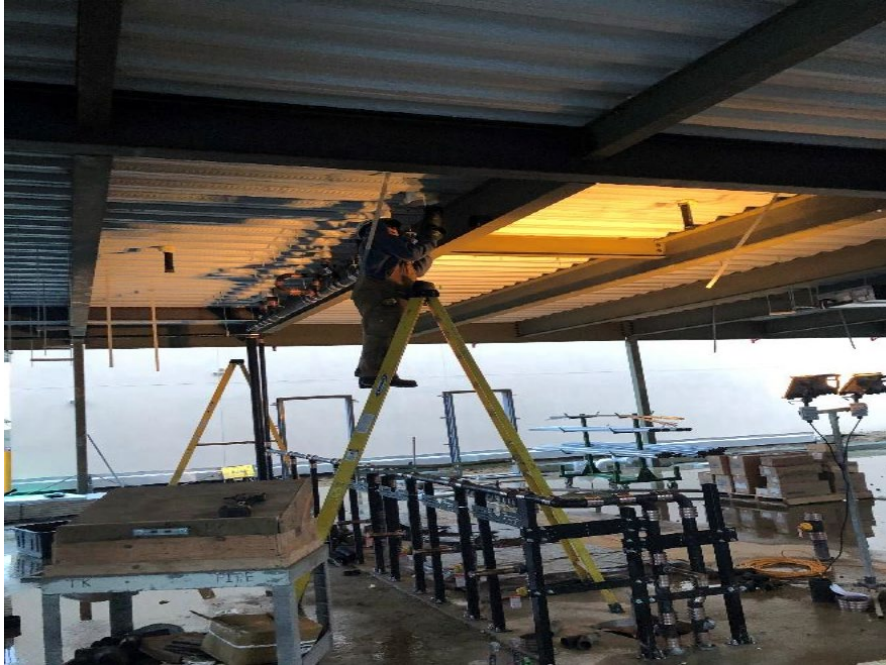
Worker installing fire suppression piping in the first floor ceiling of Building B.