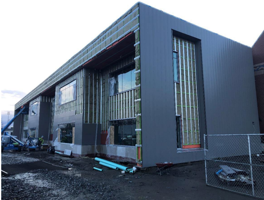
Northwest elevation of new Building A addition, showing progress with exterior siding installation.