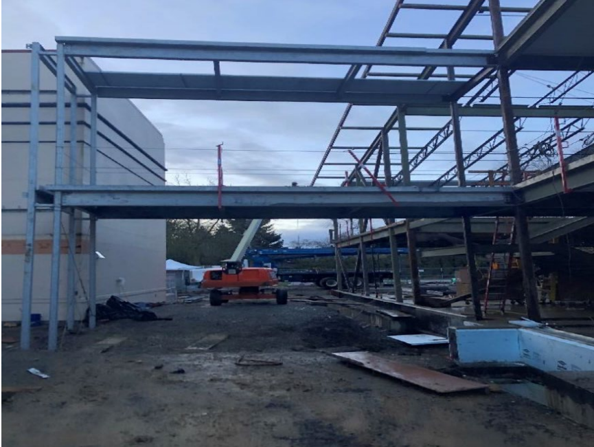
Connecting walkway between new Building B (right) and existing Building A(left) being structurally framed in.