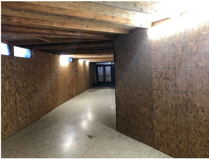
Temporary tunnel connecting academic and activities wings, with improved lighting. This is near the re-opened PAC exit.