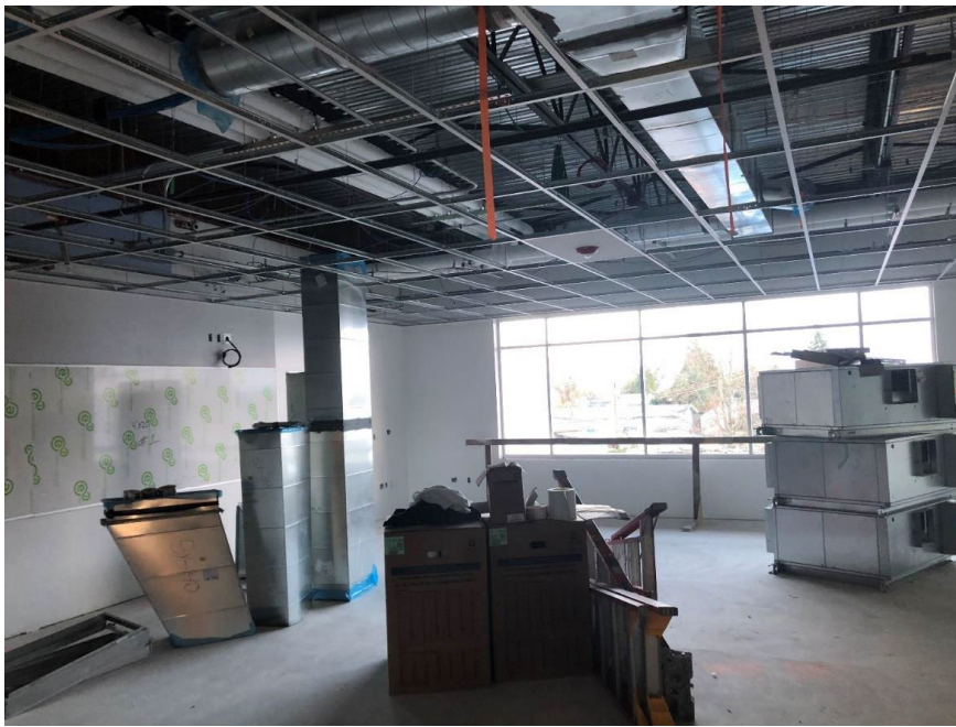
New classroom in Building A addition.