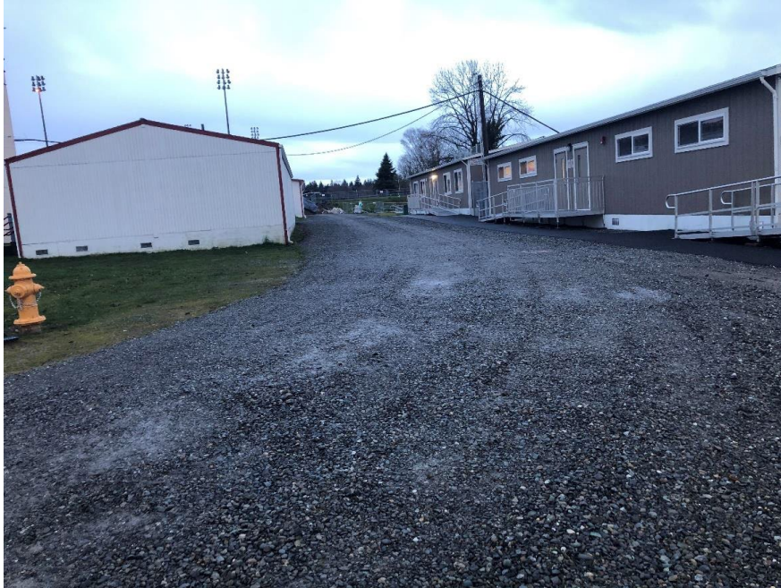
Repaired fire lane where settlement had occurred.