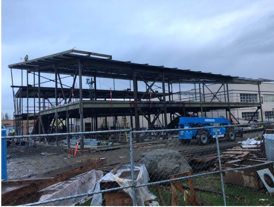
Southwest elevation of Building B progress.