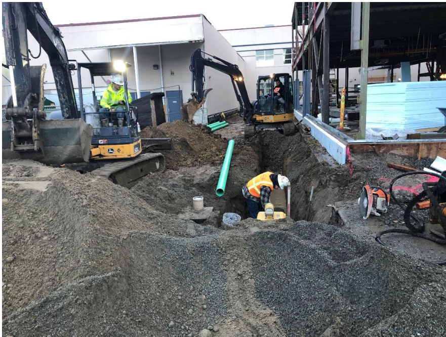
Excavating for storm drain trench on the north side of Building B, where significant groundwater is hampering efforts.