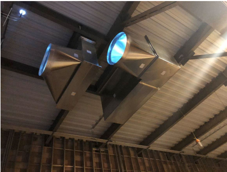
Significant ducting installed in the ceiling of the gymnasium expansion.