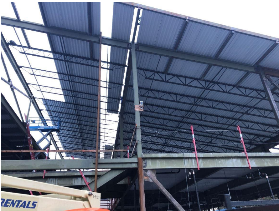
Sheet metal roof deck above the second floor of Building B.