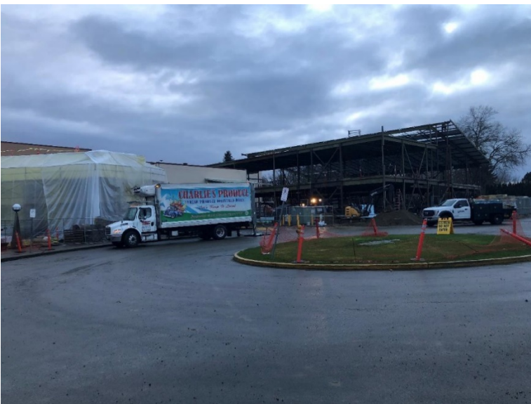
Northwest elevation of the campus additions Area A Commons (left, tented off) and new Building B (right)